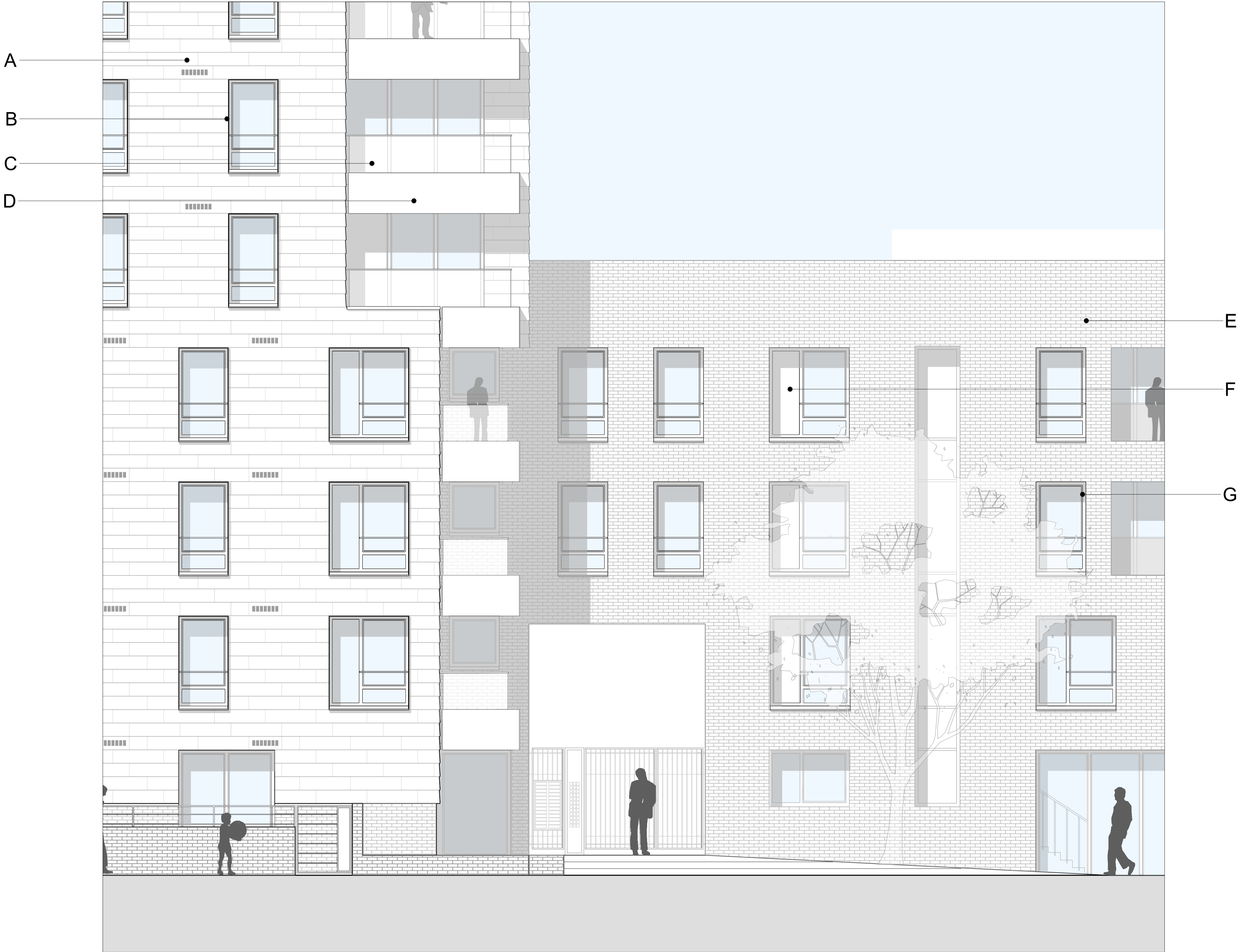
01 EAST ELEVATION