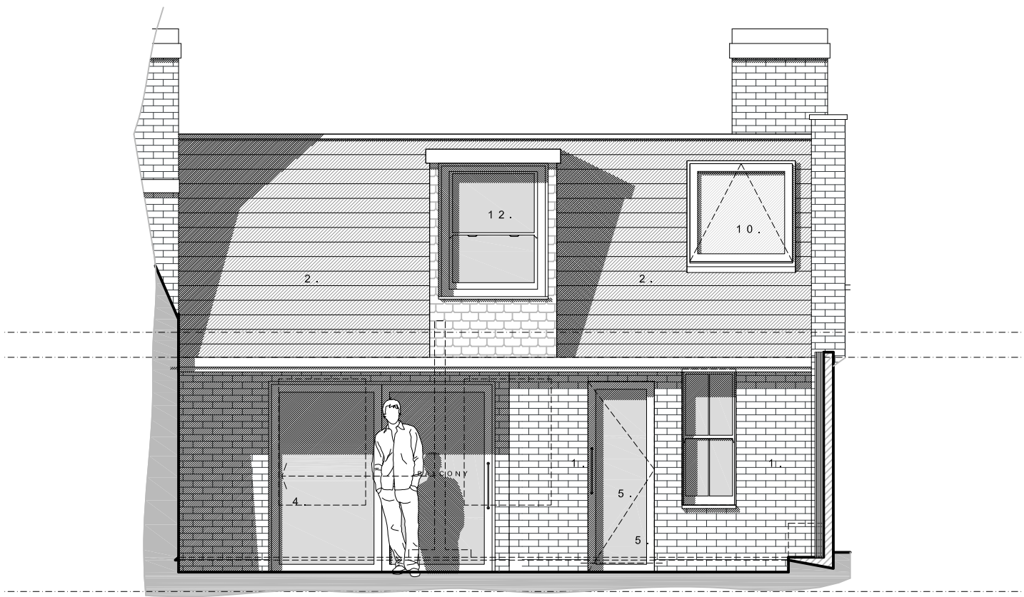
PROPOSED SECTION C - C SCALE 1 : 50