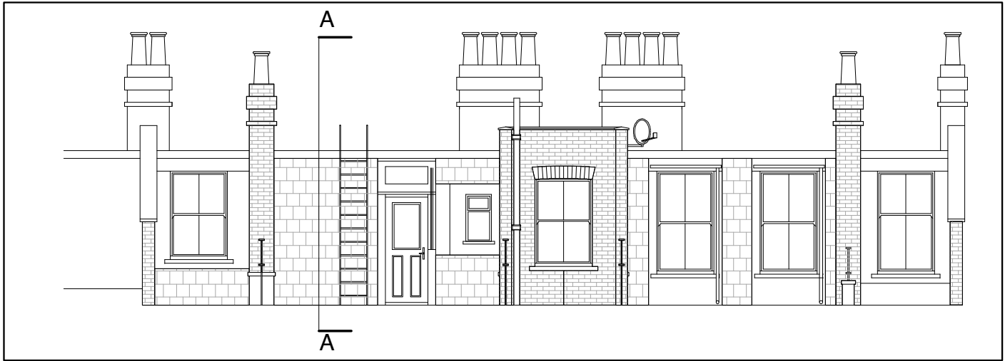
EXISTING REAR ELEVATION SCALE 1:100 @ A3