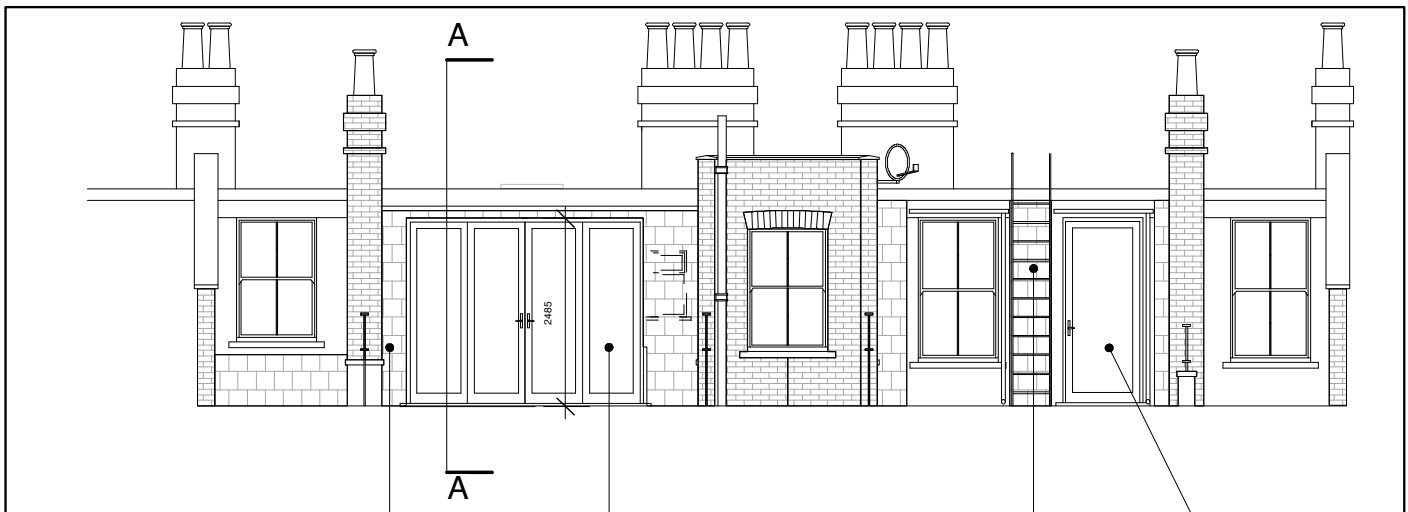
PROPOSED REAR ELEVATION SCALE 1:100 @ A3

Proposed external wall cladded in roof tiles to match existing materials