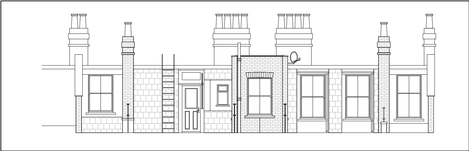
EXISTING REAR ELEVATION SCALE 1:100 @ A3