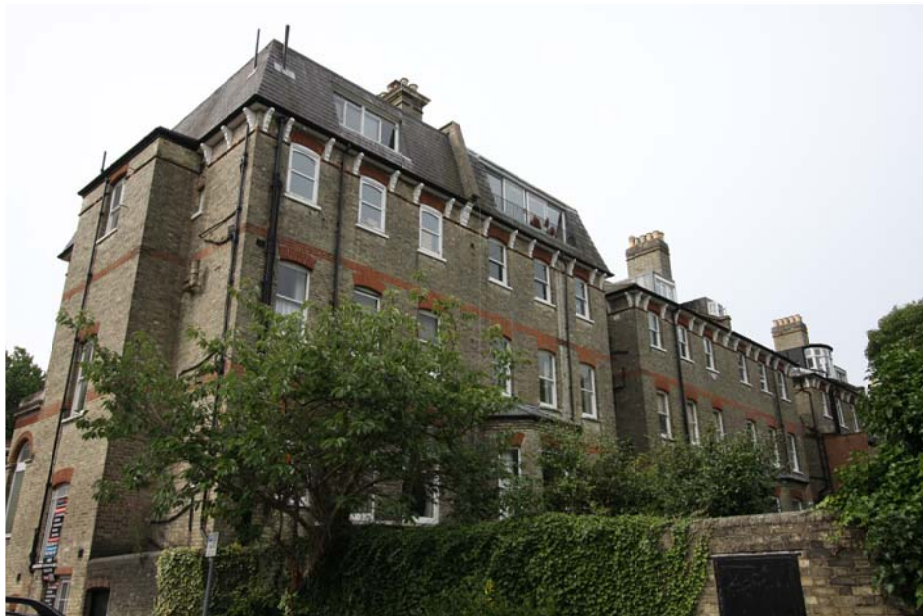
01 PL03 PHOTOGRAPH OF EXISTING REAR ELEVATION