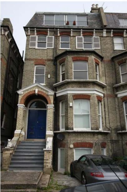
01 PL03 PHOTOGRAPH OF EXISTING FRONT ELEVATION