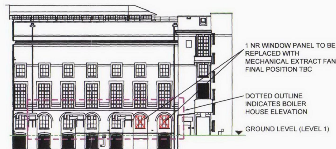
SOUTH EAST ELEVATION OF KEB