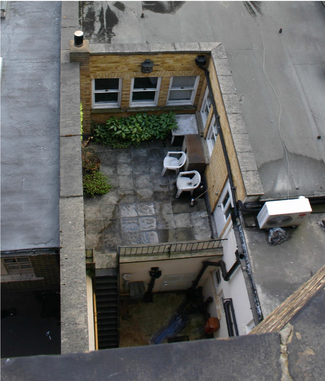
16 SP Rear Elevation

Notes Copyright remains the property of Canaway Fleming Architects and this drawing is not to be used for any purposes without the express permission of the Architect. No implied License is given for its use.