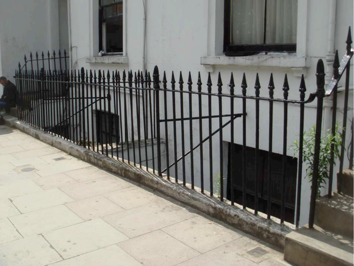
The open lightwells to Nos. 197 and 199 Royal College Street showing the stall riser, railings and finials