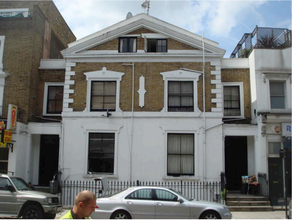
Nos. 197 and 199 Royal College Street showing the original double leaf entrance and open lightwell with stall riser, railings and finials

"Nos. 197-209 comprise a terrace of 7 paired 2-storey plus attic and basement houses, with gabled central elevations and set back side entrance bays. Nos. 197 and 199 are the best preserved, and survive as dwellings...."