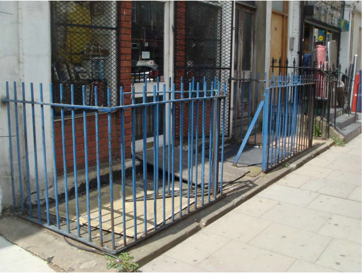
The entrance to No 207 Royal College Street showing the lightwell currently closed with pavement lights and railings around its perimeter.