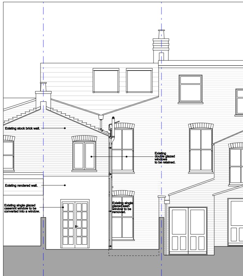
01 Existing rear elevation 1:100@A3