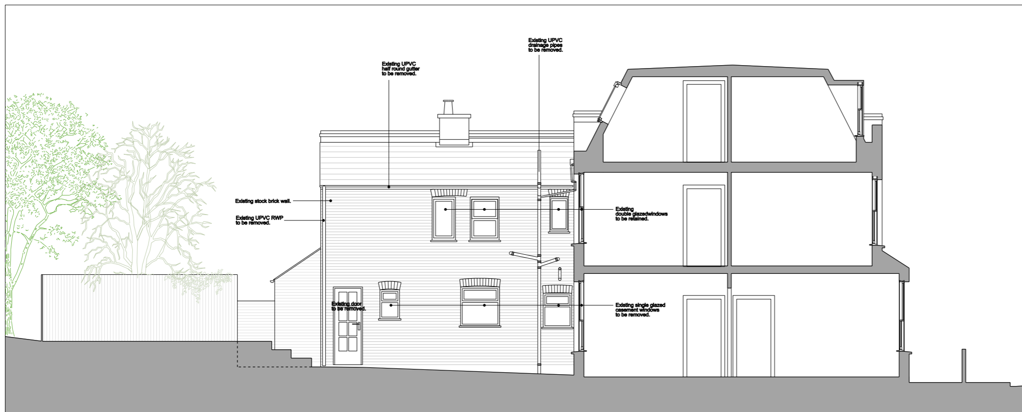
03 Existing long section looking east 1:100@A3

Drawings may be scaled for purposes of Planning. Any discrepancies should be reported immediately to the designer. If in doubt ask. This drawing is copyright of the designer.