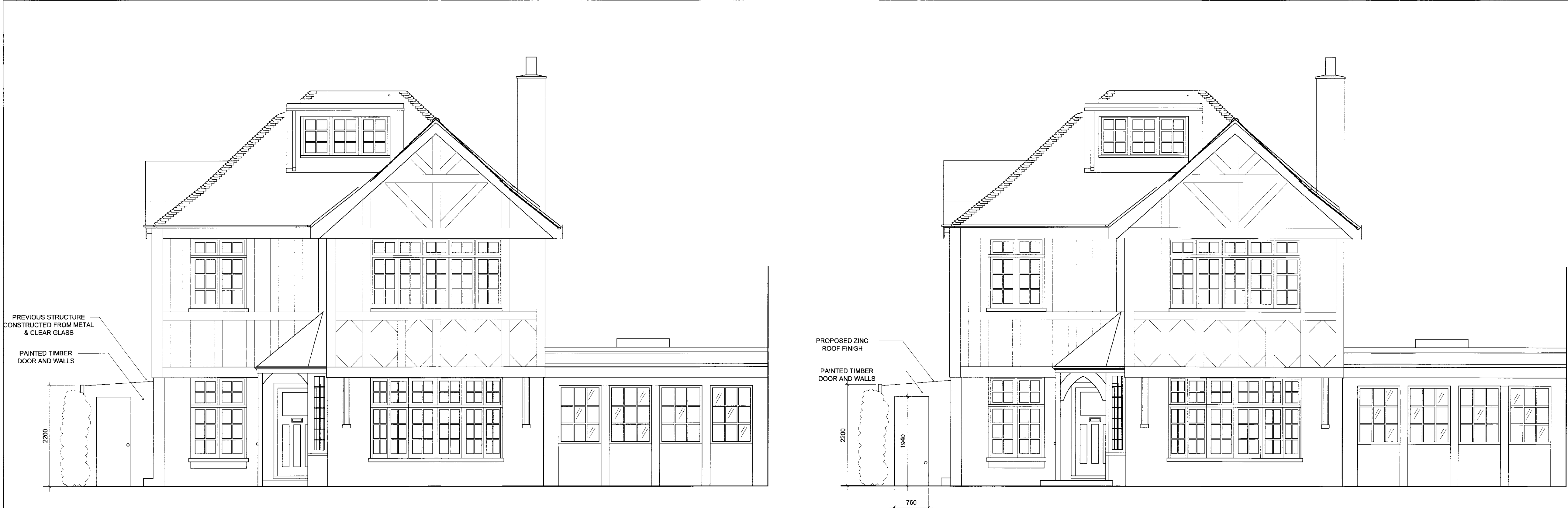
E | PREVIOUS STRUCTURE ELEVATION SCALE 1:50