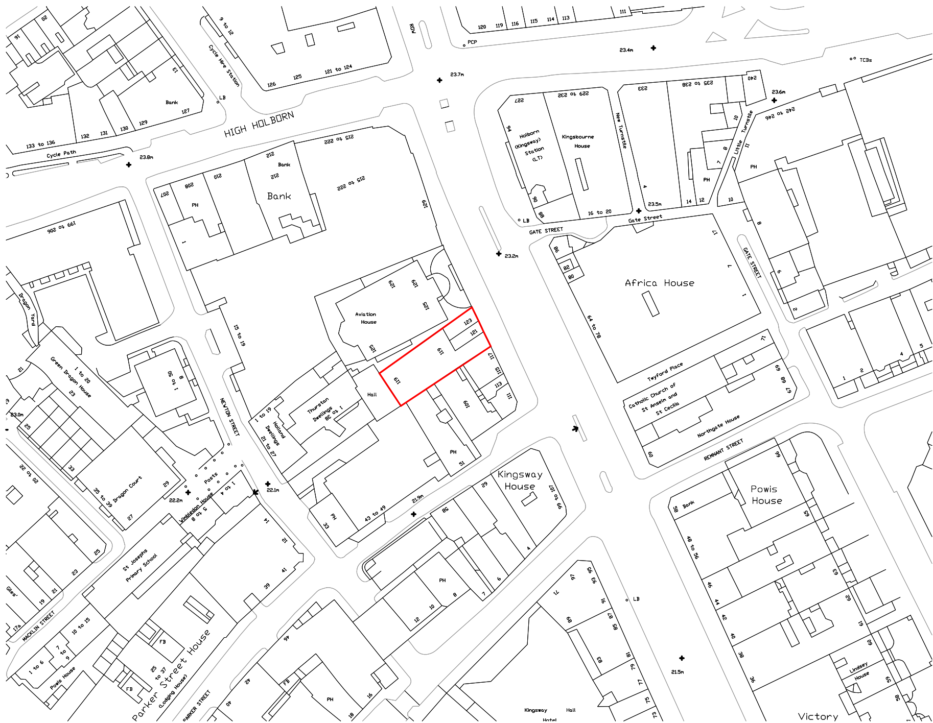
01 Site Location Plan 00_101 Scale 1:1250@A3

Do not scale from this drawing. Contractor to take and check all dimensions on site before work commences. Discrepancies to be reported to the architect. Subcontractor to verify all dimensions on site before making a shop drawing commencing manufacture. This drawing is copyright. (c) 2006