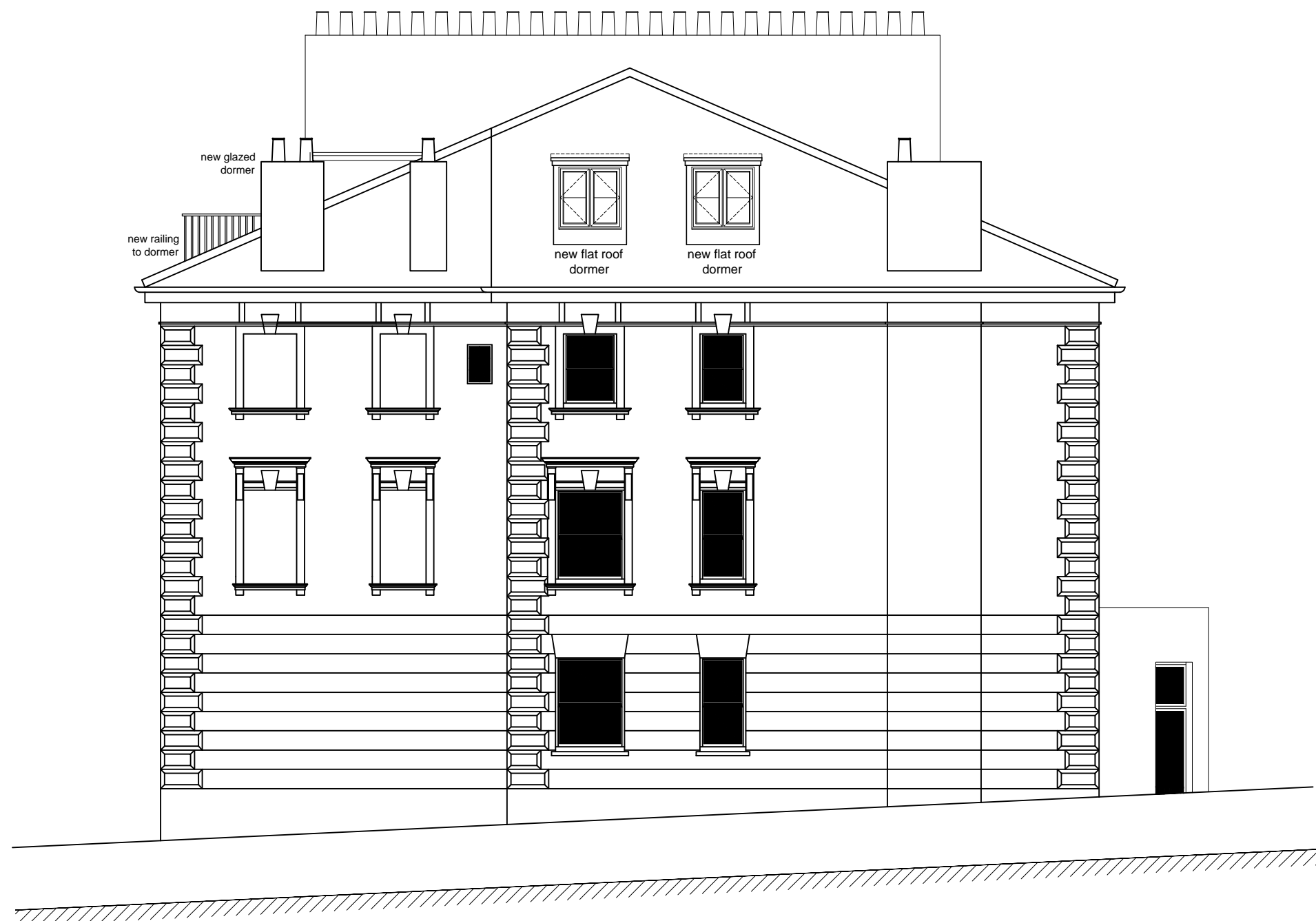
proposed - side elevation