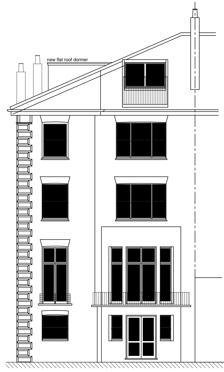
proposed - rear elevation