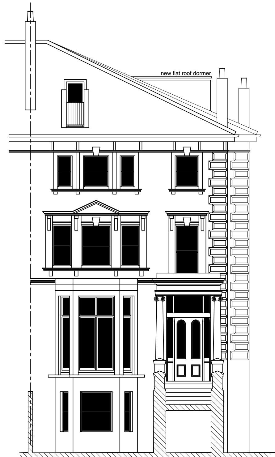
proposed - front elevation