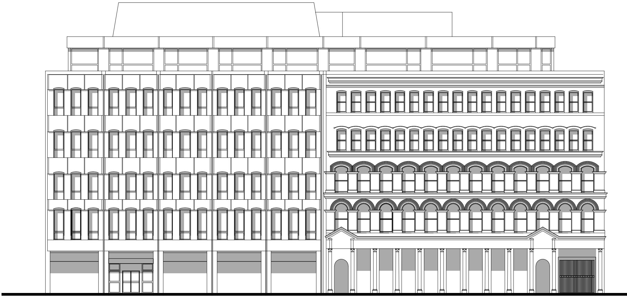
EXISTING NORTH WEST ELEVATION C