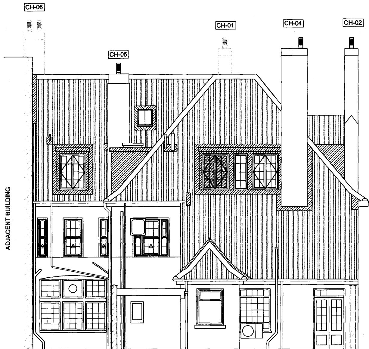
Existing Rear Elevation - View C Scale 1:100

Drawing to be read in conjunction with: B Williamson, SCH Vent 1001 sheet 2 of 5 (latest revision)