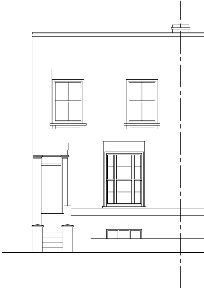
FRONT ELEVATION (UN-ALTERED)