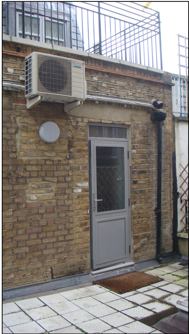
Image of door providing access to the roof area for maitanace, including gutters and air-conditioning units.