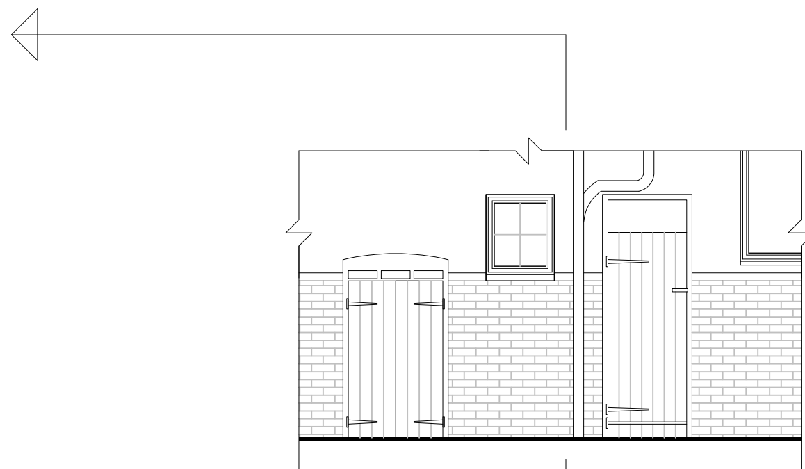
EXISTING SIDE ELEVATION FRAGMENT