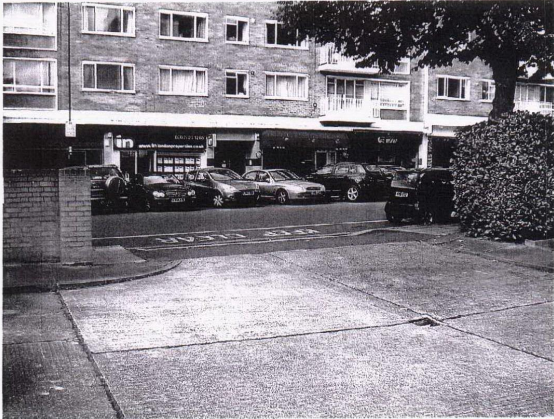
Photograph illustrating the car park entrance taken from the car park looking out onto Fairfax Road.