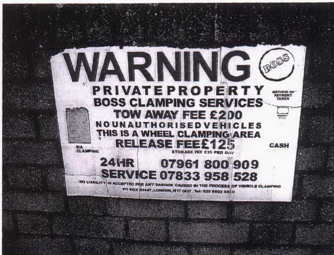
Photograph of a sign in the car park illustrating the current method of deterring unauthorised vehicles from parking.