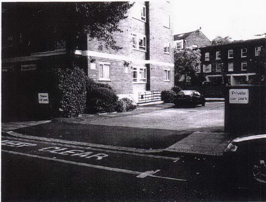
Photograph of the car park entrance of Byron Court, 50 Fairfax Road, London.