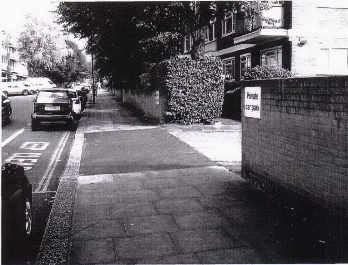
Photograph illustrating the car park entrance taken from the pavement on the right hand side. The distance from the car park entrance to the edge of the keep clear sign is 5 meters.