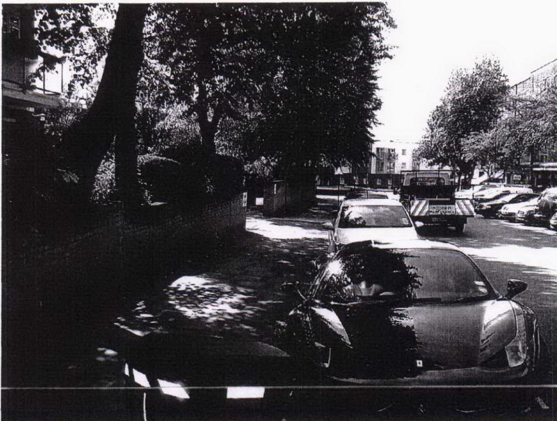
Photograph illustrating the car park entrance taken from the left hand side on Fairfax Road.