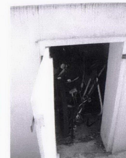
Images of existing front lightwell with coal vaults