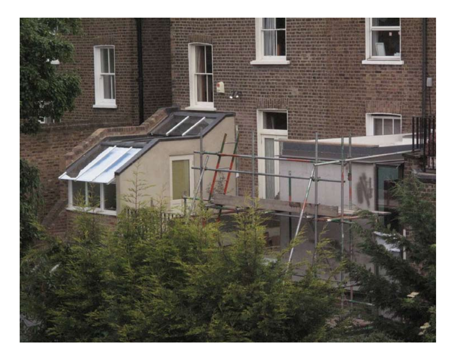
No.s 68 & 70 Patshull Road New roof terrace overlooking neighbouring gardens. Balcony with glass balustrade under construction. Planning granted in 2008 with amendments submited 2010