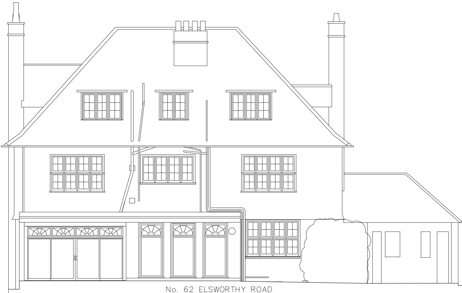
No. 62 ELSWORTHY ROAD NORTH/REAR ELEVATION

ELSWORTHY ROAD CURVES SO ELEVATIONS OF No.'s 60 & 64 HAVE BEEN ROTATED AROUND THESE PIVOT POINTS