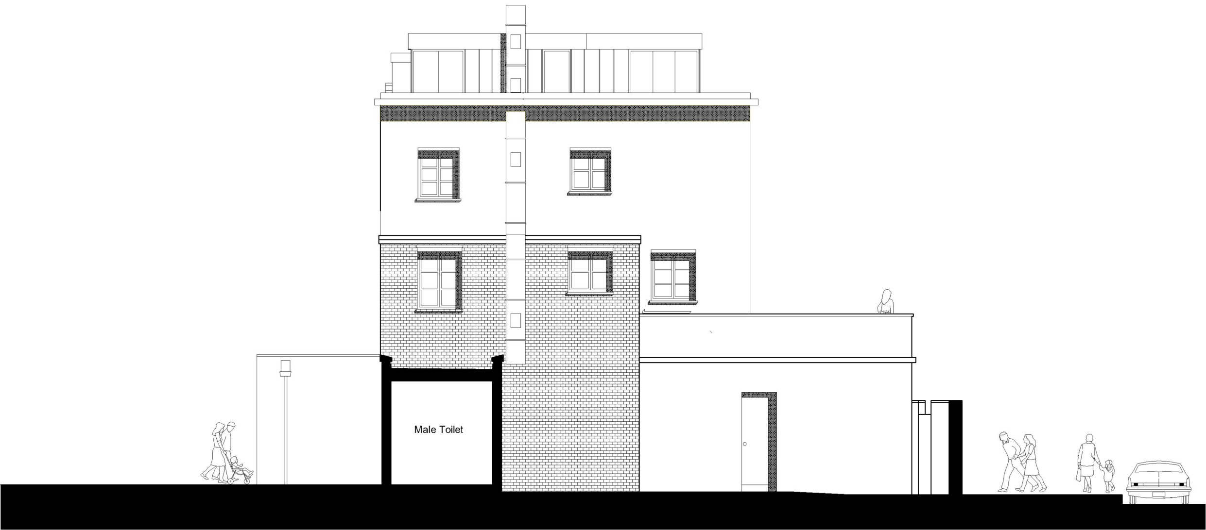
SERVICE YARD (EAST) ELEVATION 1:50