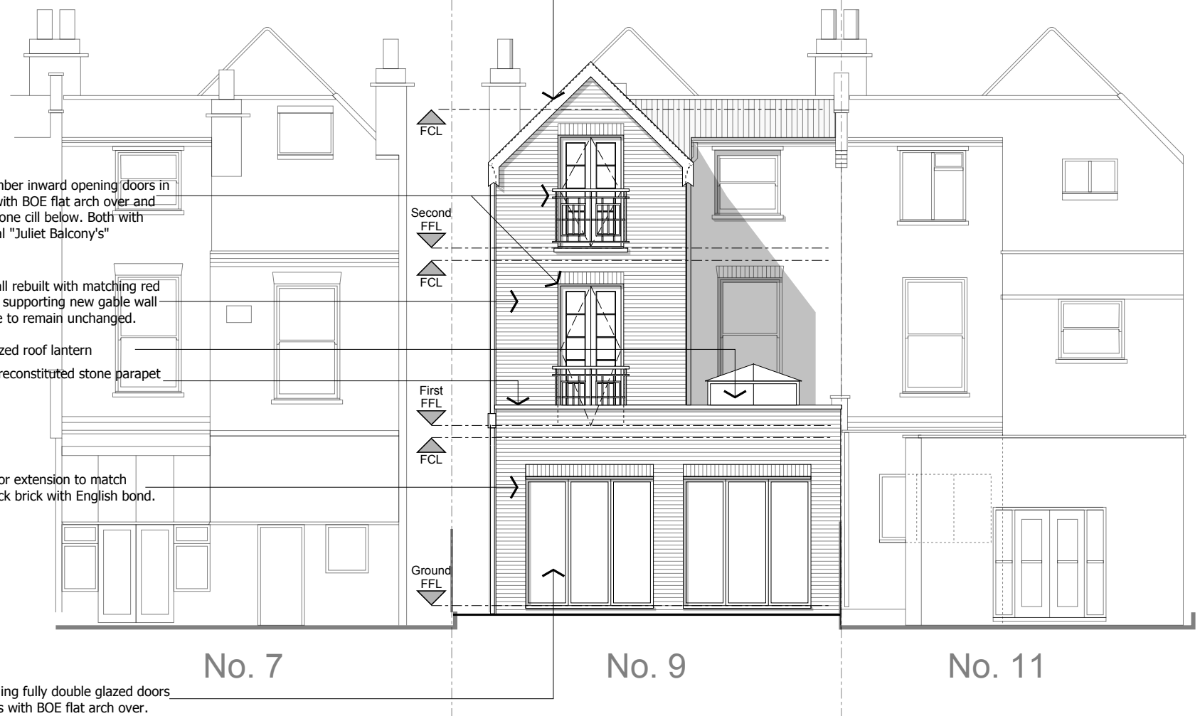
Proposed Rear (South) Elevation

New sliding folding fully double glazed doors in new openings with BOE flat arch over.