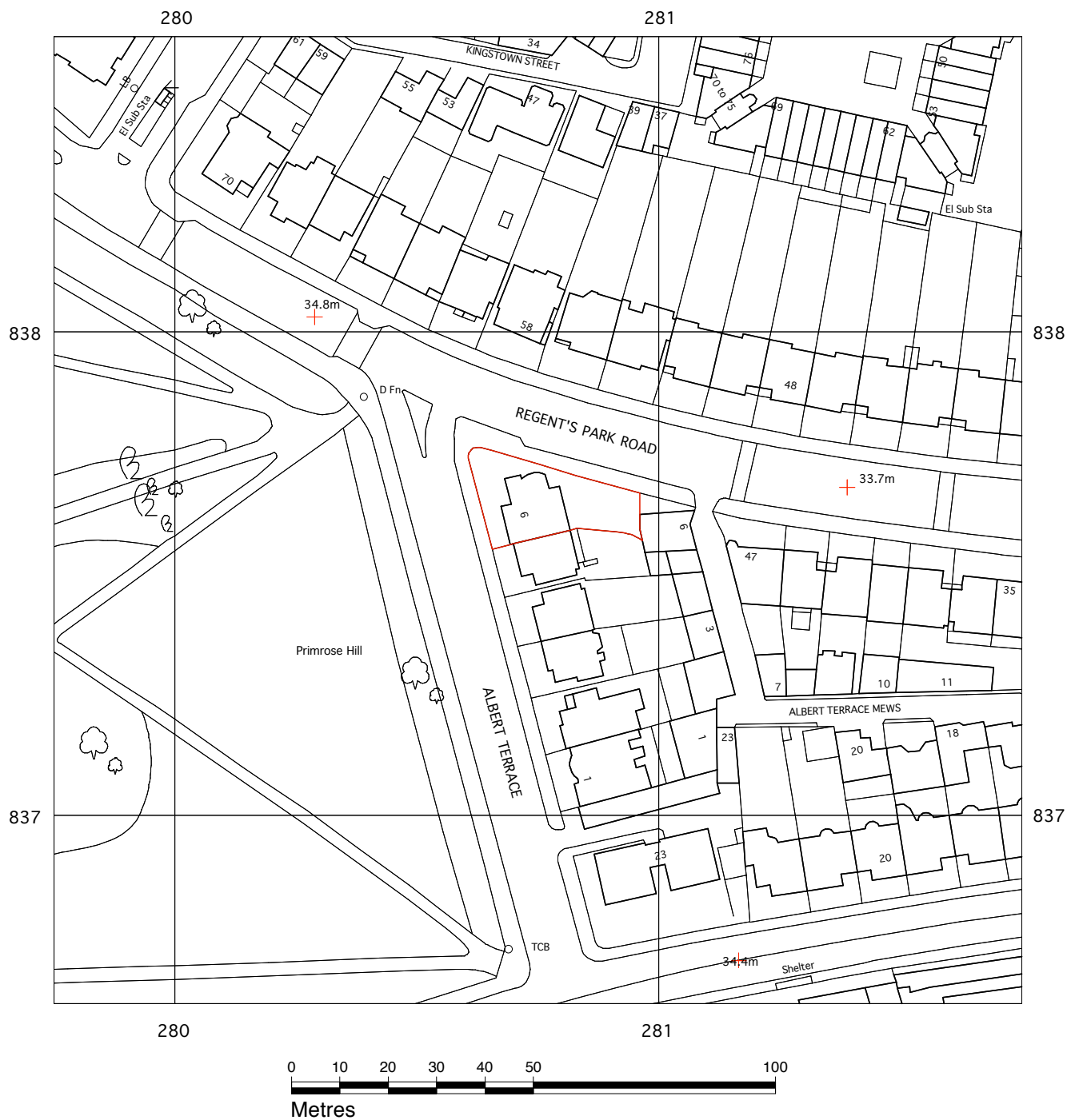
1 Site Location Plan Scale - 1:1250 @A3