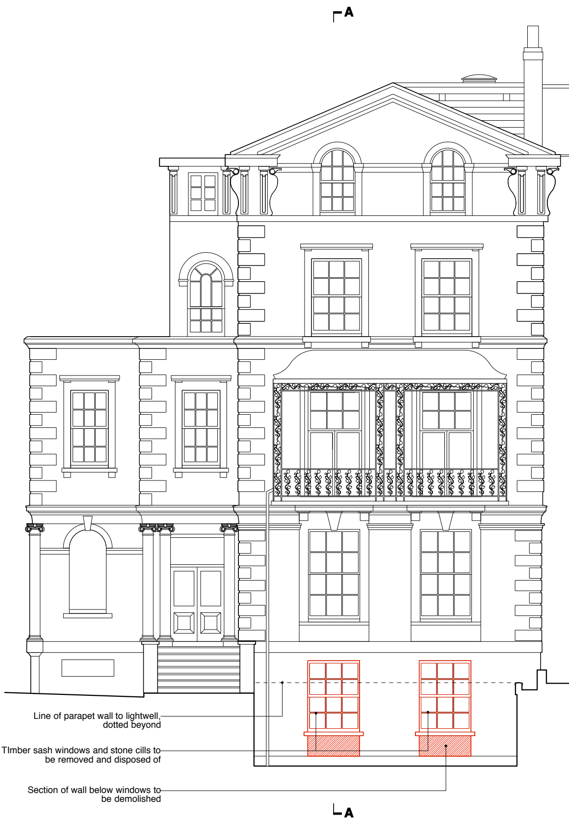
1 Front Elevation Demolition