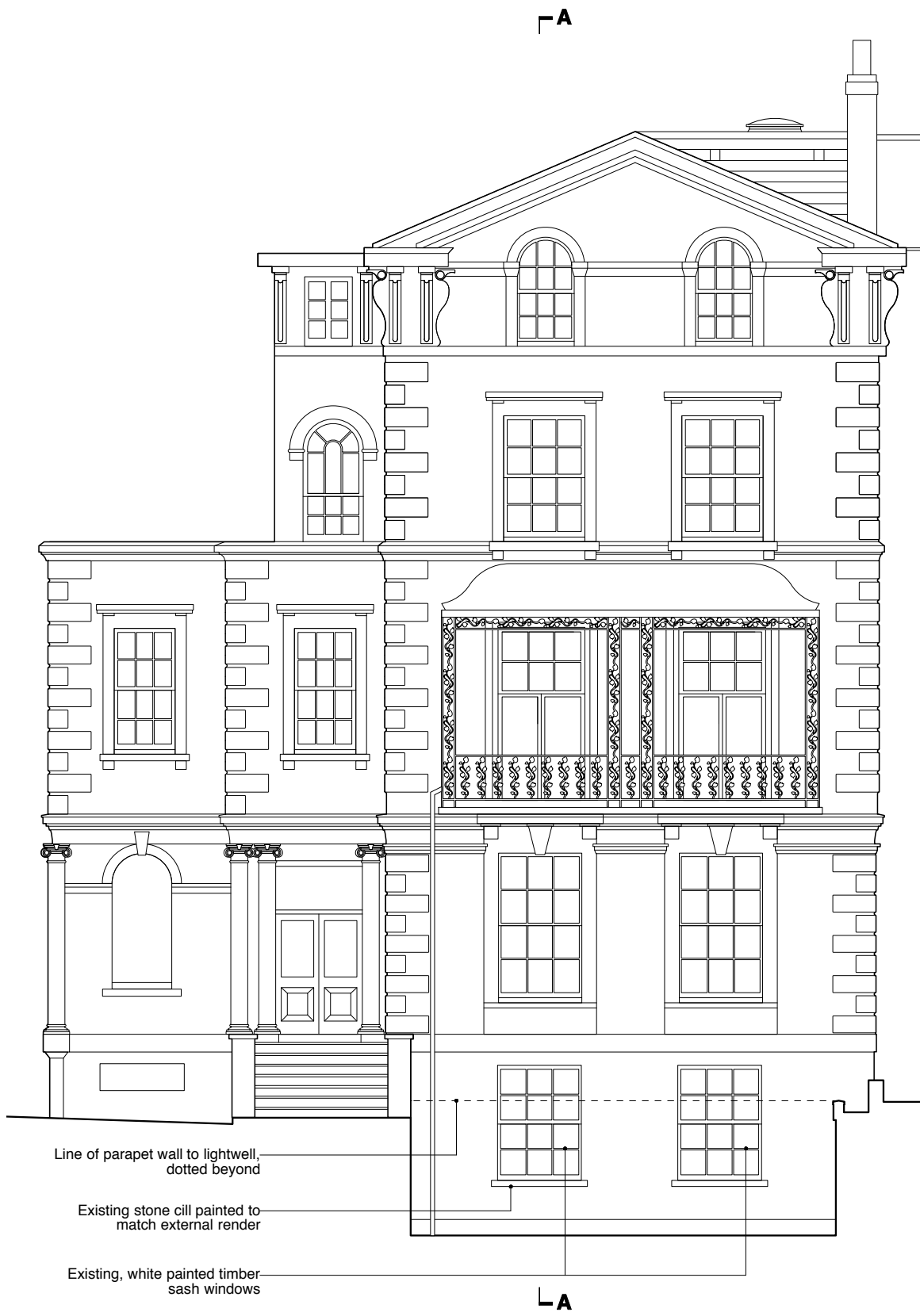
1 Existing Front Elevation Scale - 1:100 @A3