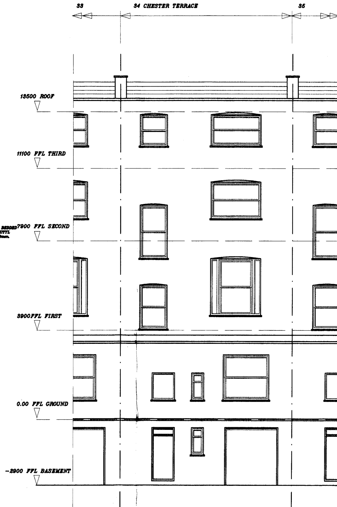
EXISTING/PROPOSED REAR ELEVATION ALL WINDOWS TO REAR ELEVATION PROPOSED 12mm."SLIMLIGHT" DOUBLE GLAZED UNITS

81 High Street Farnborough, Kent, BR6 7BB Tel: 01689 851333 Fax: 01689 851830