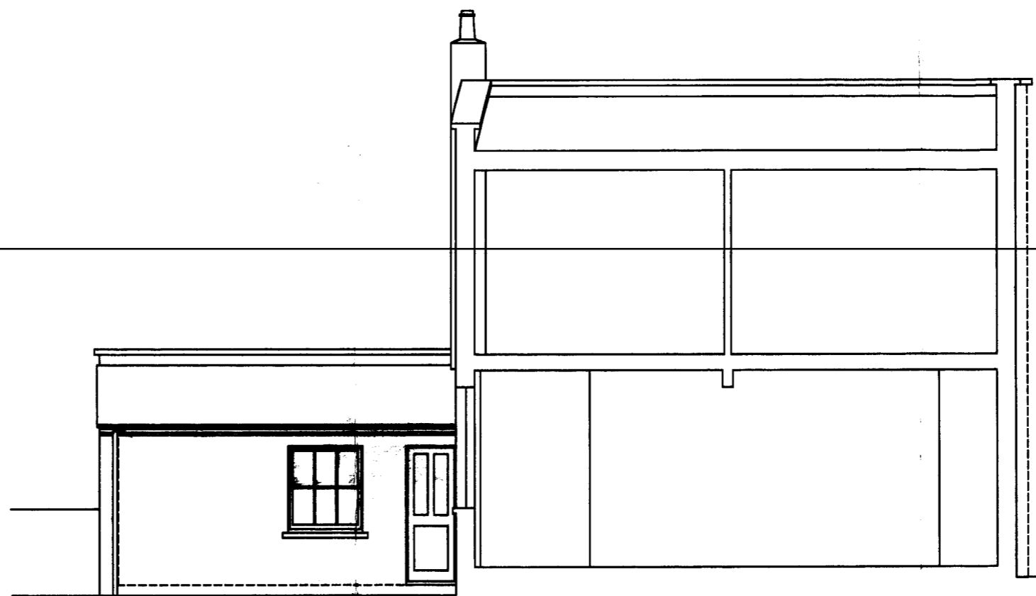
SIDE ELEVATION & SECTION

LONDON BOROUGH OF CAMDEN TOWN AND COUNTRY PLANNING ACTS 27 AUG 2003 PLANS APPROVED ON BEHALF OF THE COUNCIL