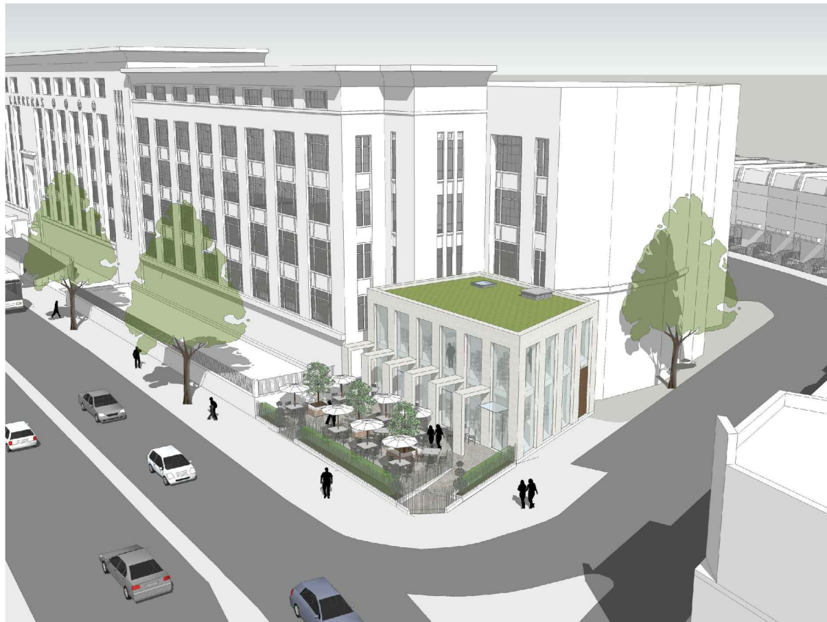
[03] AERIAL VIEW FROM COBDEN JUNCTION