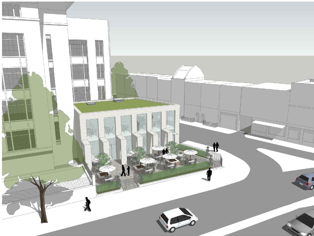
[02] VIEW FROM HAMPSTEAD ROAD