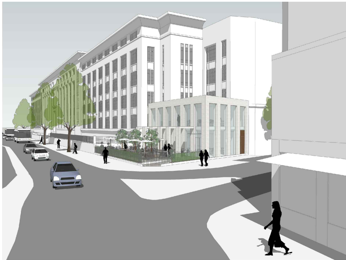
[01] STREET VIEW FROM COBDEN JUNCTION