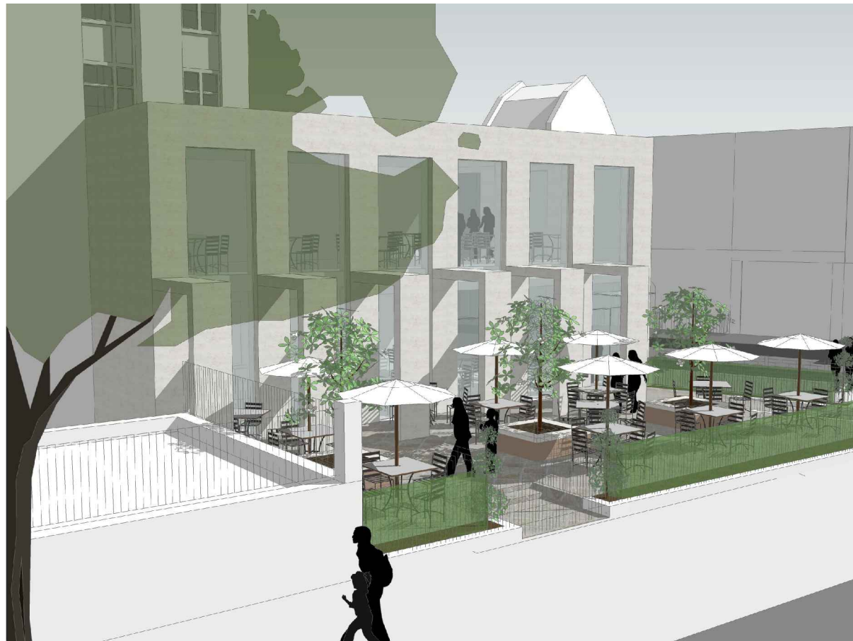
[05] STREET VIEW OF FRONT ELEVATION FROM HAMSTEAD ROAD

VIVENDI ARCHITECTS LTD Unit E3U, Bounds Green Industrial Estate, Ringway, London N11 2UD Tel/Fax +44 (0)20 3332 4000 - email: info@vivendiarchitects.com © VIVENDI ARCHITECTS LTD 2009 All rights reserved, including but not limited to The Copyright, Designs and Patents Act 1988