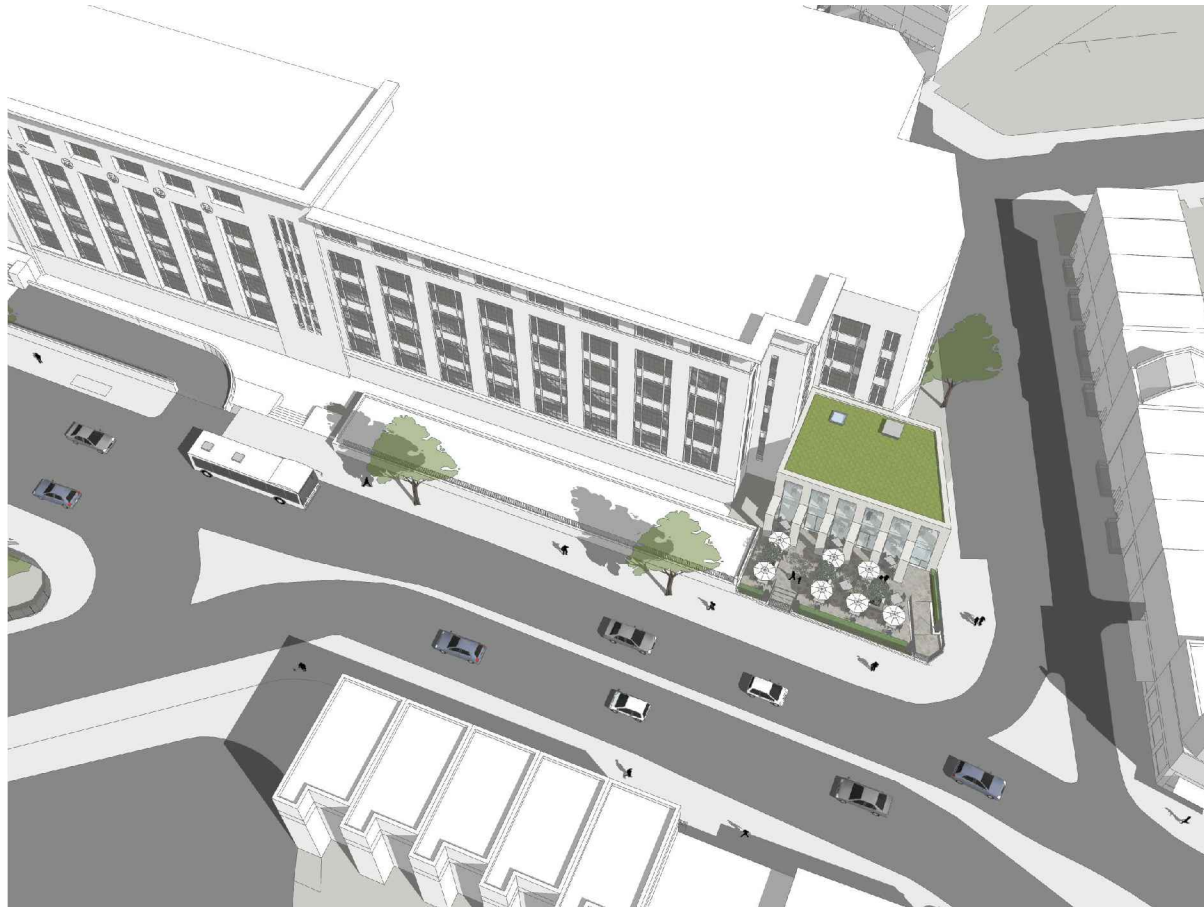
[04] AERIAL VIEW