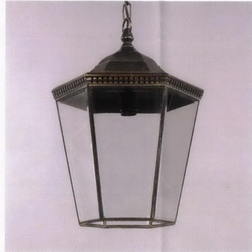
Georgian Porch Lantern

Large, Bronze, 1 Light Available with 3 way fitting if required