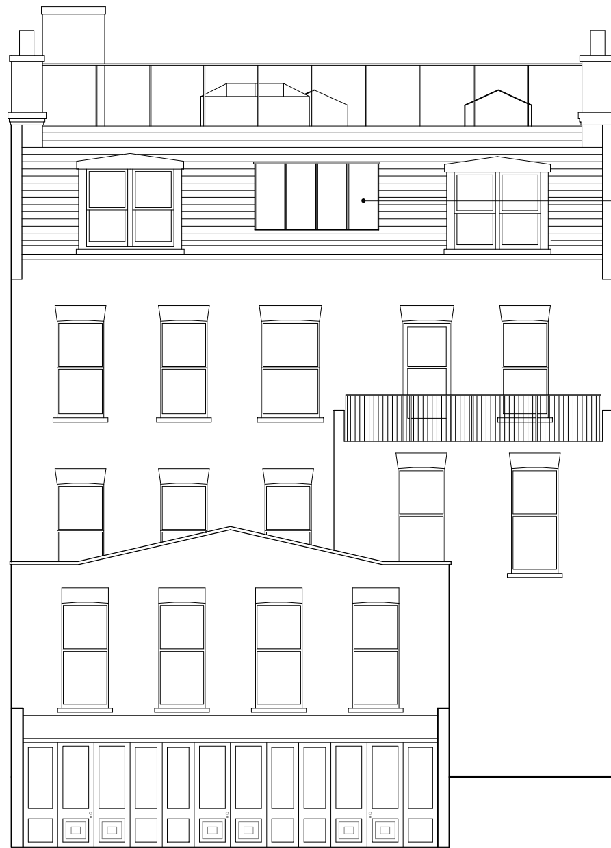
REAR ELEVATION - AS PROPOSED