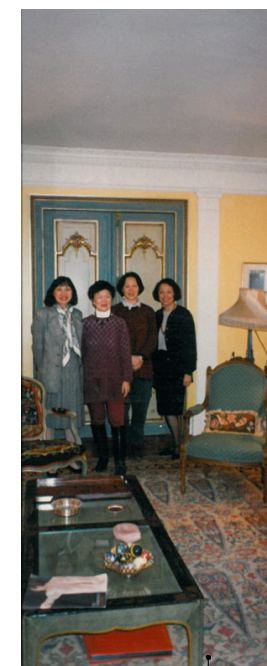
PHOTOS FROM FRONT RECEPTION ROOM WINDMILL HILL HOUSE