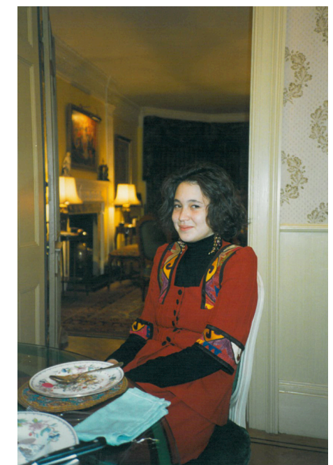
PHOTO FROM REAR RECEPTION ROOM ENFIELD HOUSE