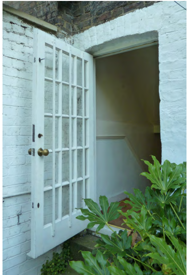
Appendix 2: 2.11 The rear door of No. 13.