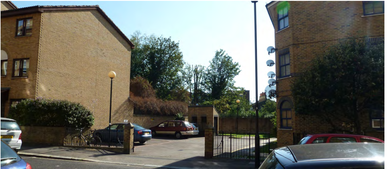
Appendix 2: 2.7 The rear part of the Jeffrey's Street terrace as seen through the gap in between the buildings on Farrier Street.