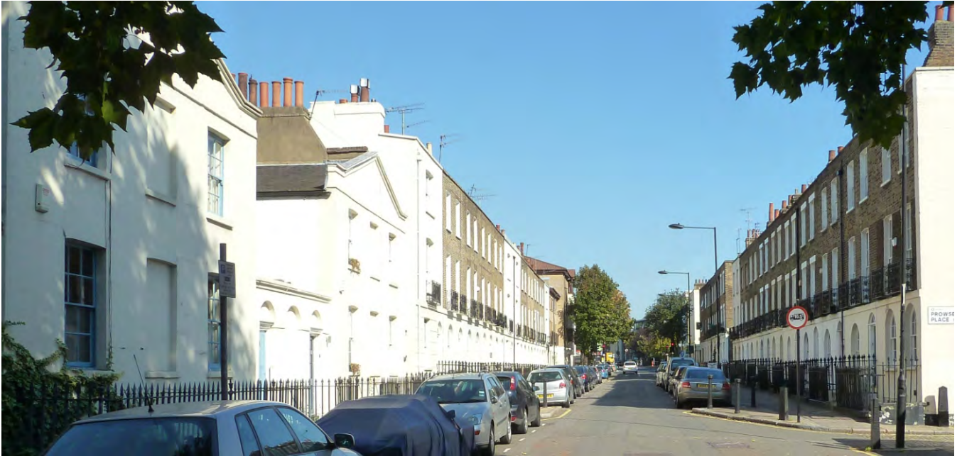
Appendix 2: 2.1 General view east along Jeffrey's Street.