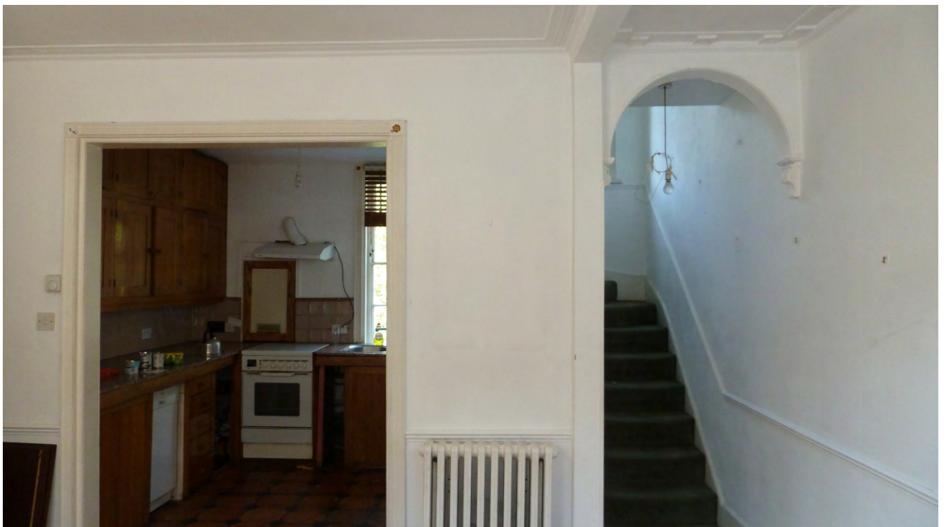
Appendix 2: 2.24 General view of the ground floor interior from the front towards the rear. Note the downstand where the hallway wall was removed.