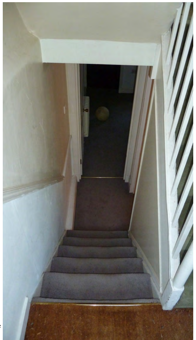
Appendix 2: 2.22 View of the basement staircase, from the half landing at the rear door.