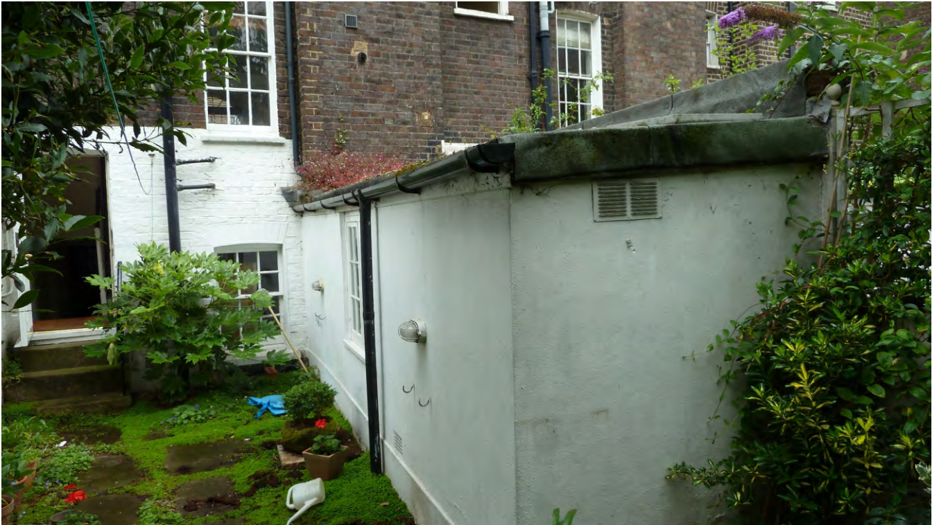
Appendix 2: 2.13 General view of the rear extension.