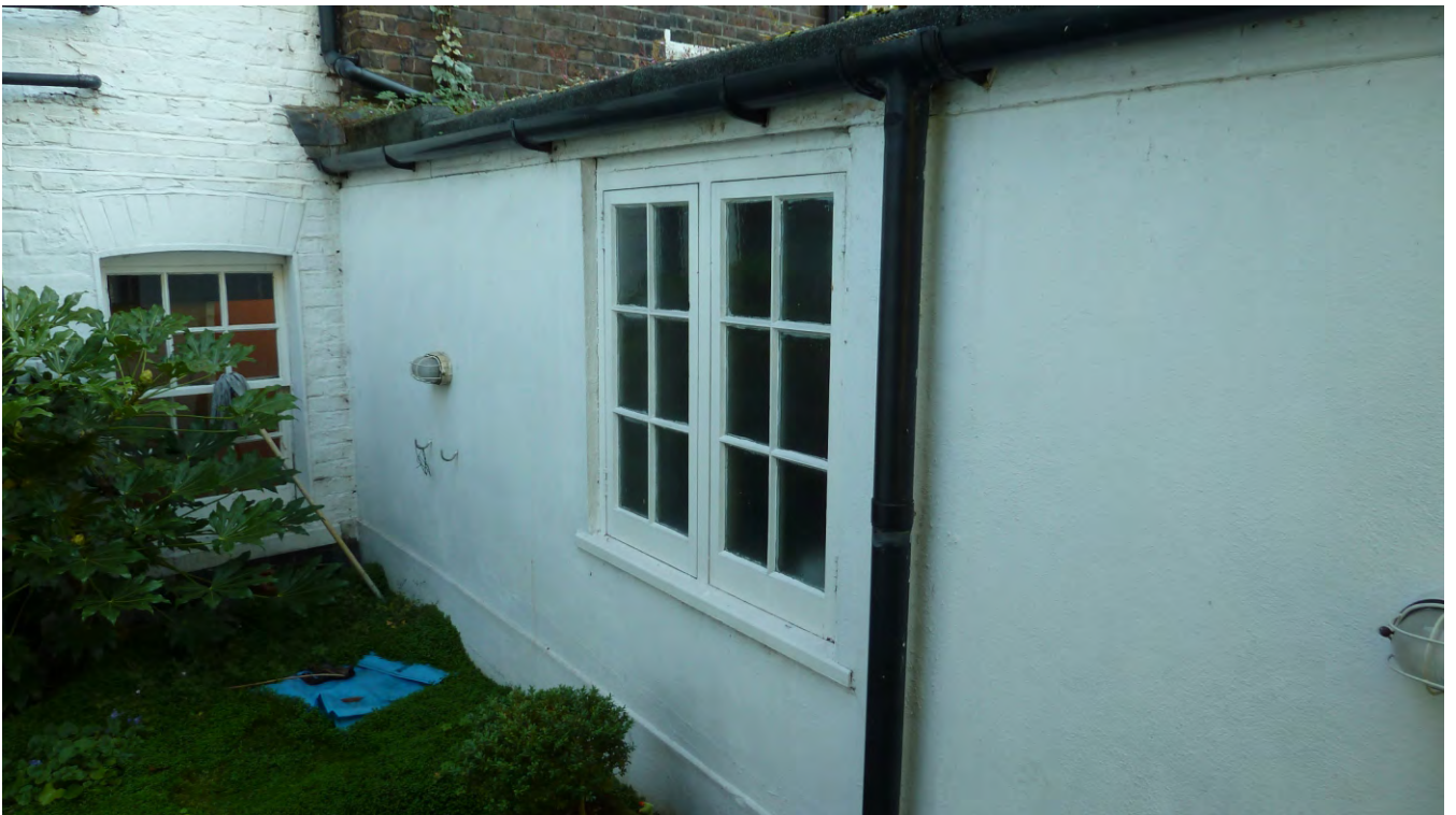
Appendix 2: 2.14 East elevation of the rear extension.