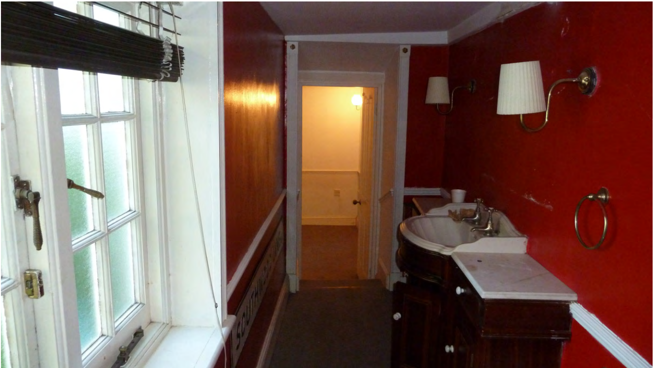
Appendix 2: 2.21 View back from inside the rear extension.