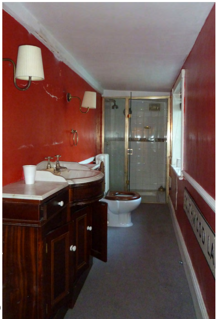
Appendix 2: 2.20 View into the rear extension.