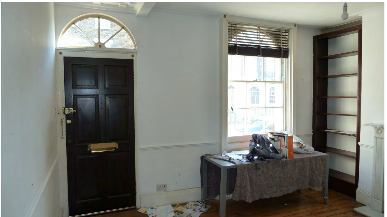
Appendix 2: 2.23 General view of the ground floor interior from the rear. Note the downstand where the hallway wall was removed.