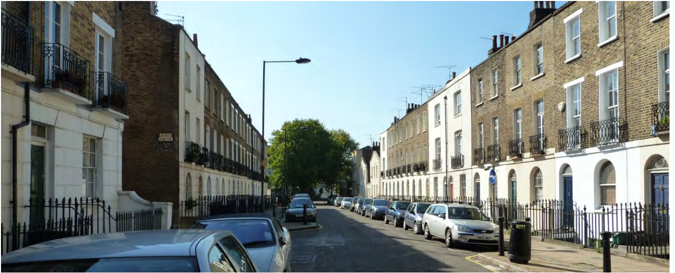
Appendix 2: 2.3 General view west along Jeffrey's Street.