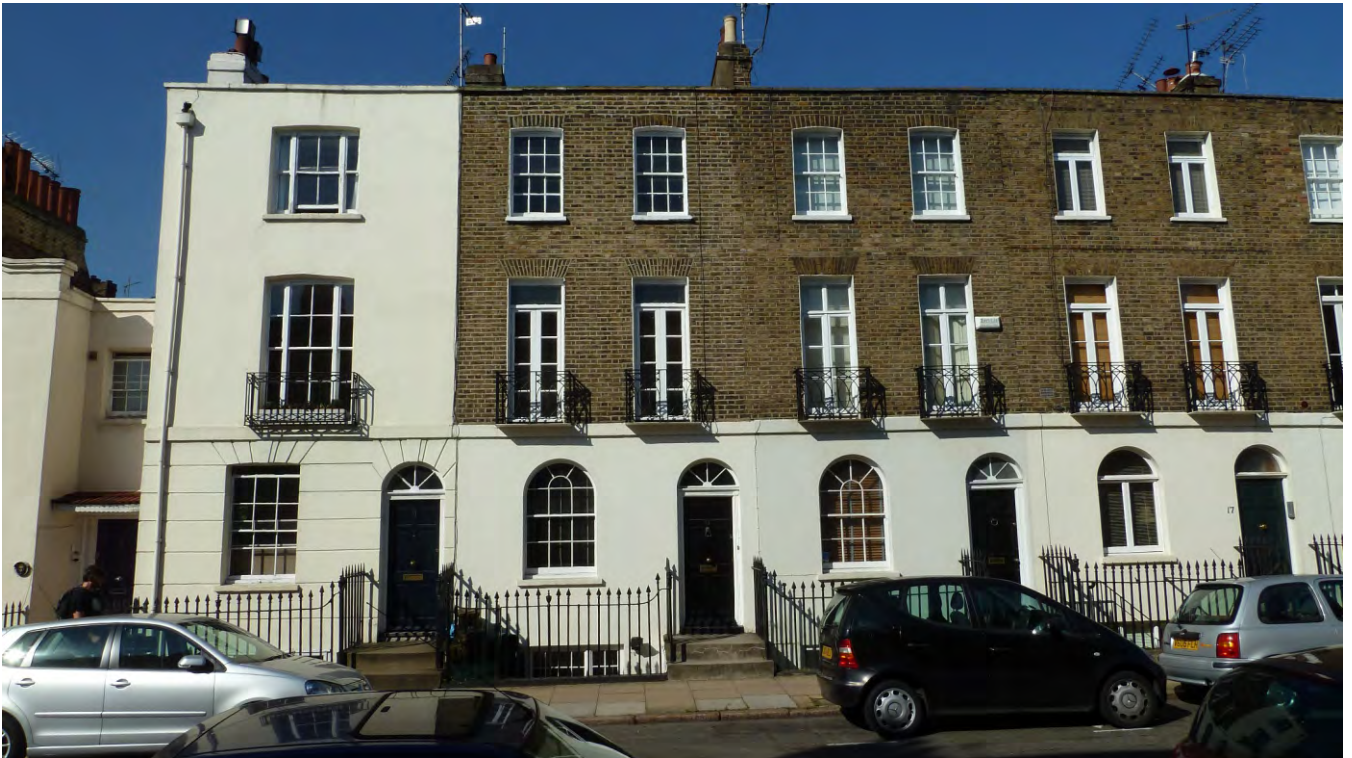
Appendix 2: 2.5 Frontal view of No. 13 in its context.