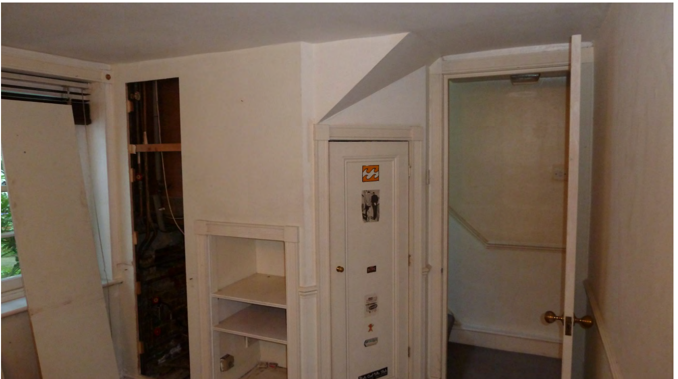
Appendix 2: 2.18 The rear basement room, looking towards the stairs.