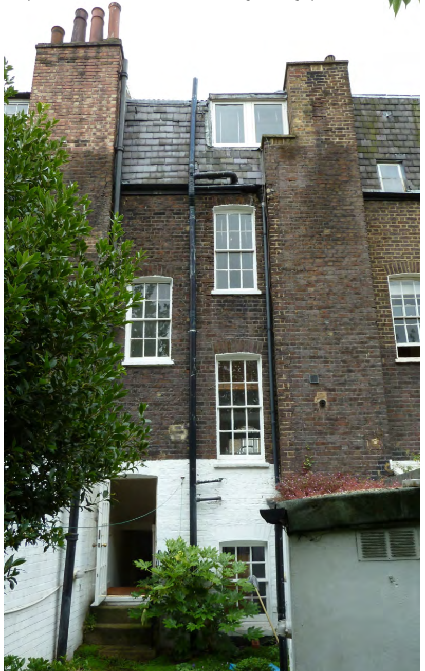
Appendix 2: 2.8 The rear elevation of No. 13.