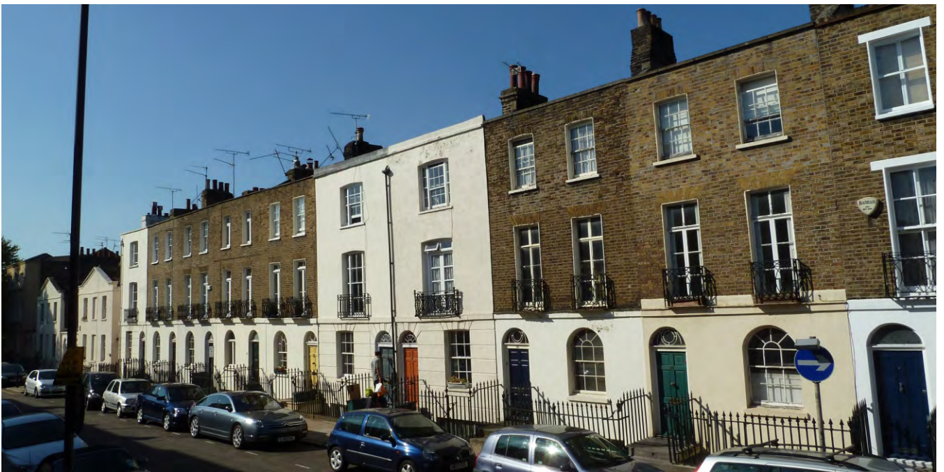
Appendix 2: 2.4 Oblique westerly view east along Jeffrey's Street, showing No. 13 in its context.