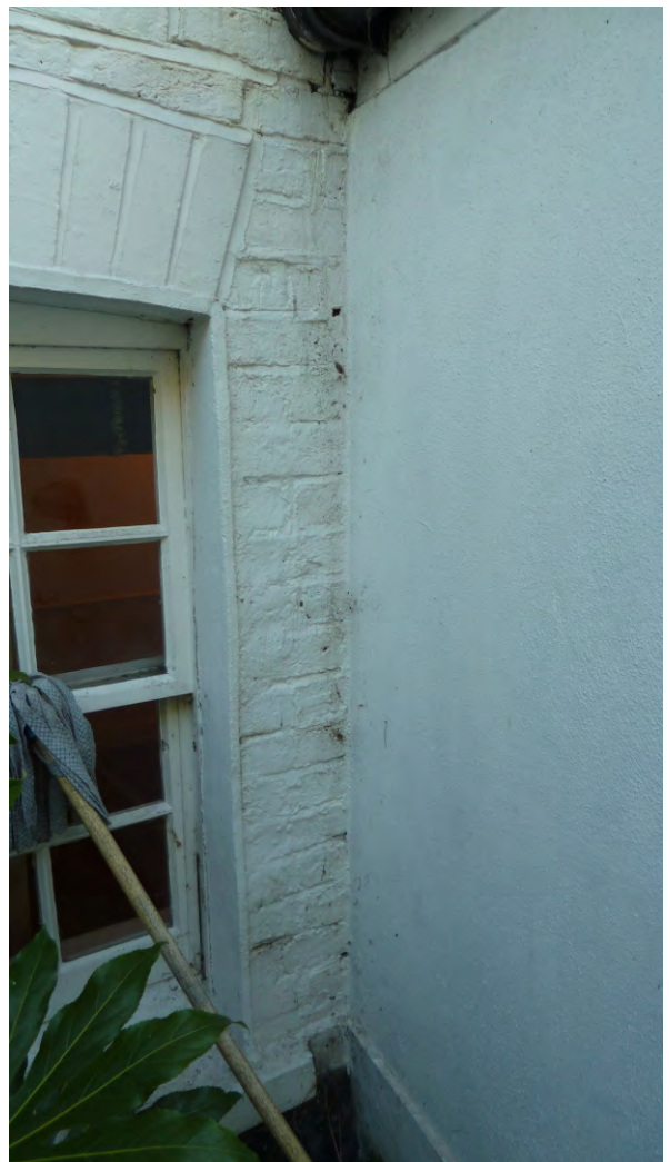
Appendix 2: 2.12 The basement rear window and junction with the extension.