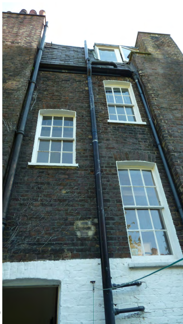
Appendix 2: 2.9 The rear elevation of No. 13.