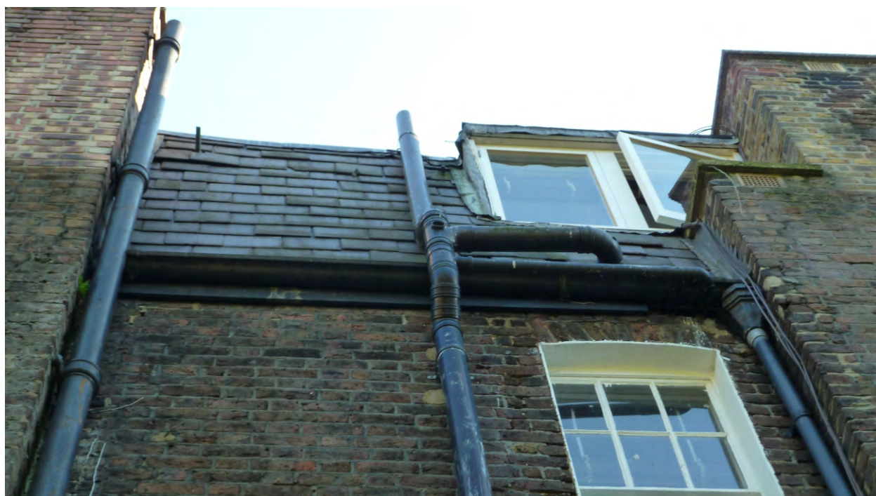
Appendix 2: 2.10 Detail of the upper part of the rear elevation.