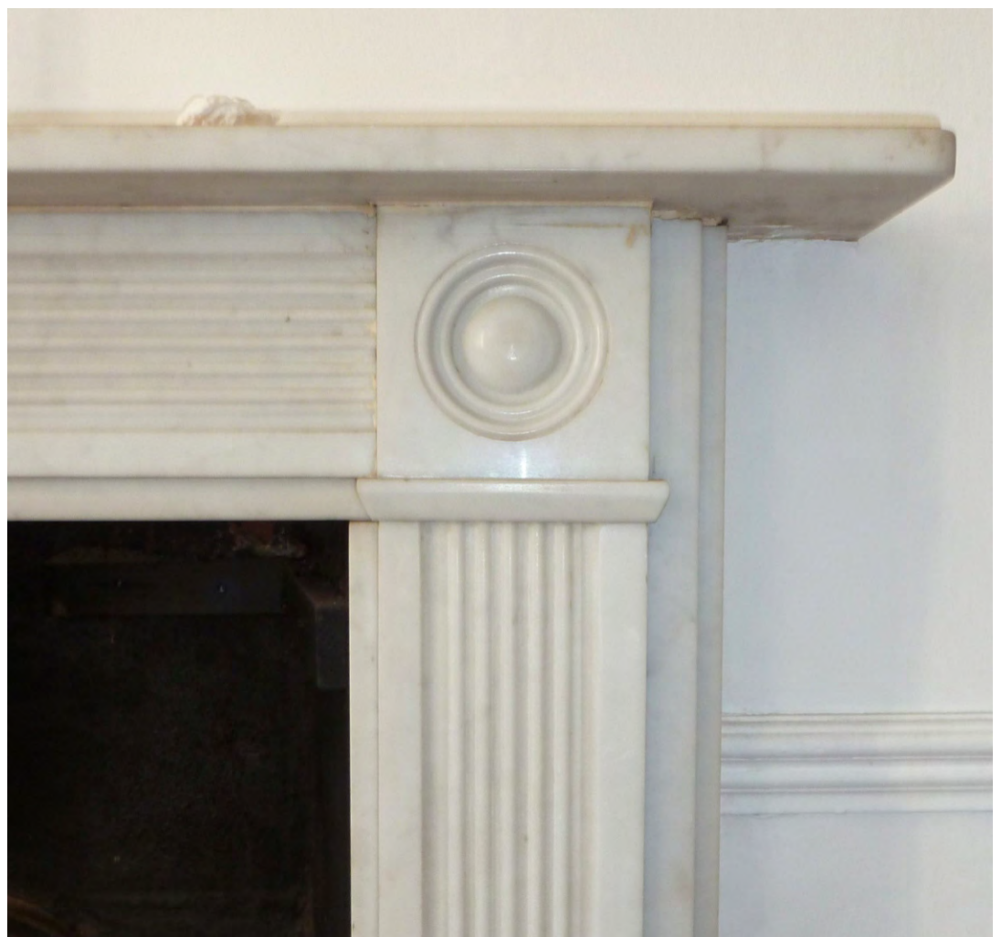
Appendix 2: 2.26 Detail of the reeded marble chimneypiece at the ground floor fireplace.