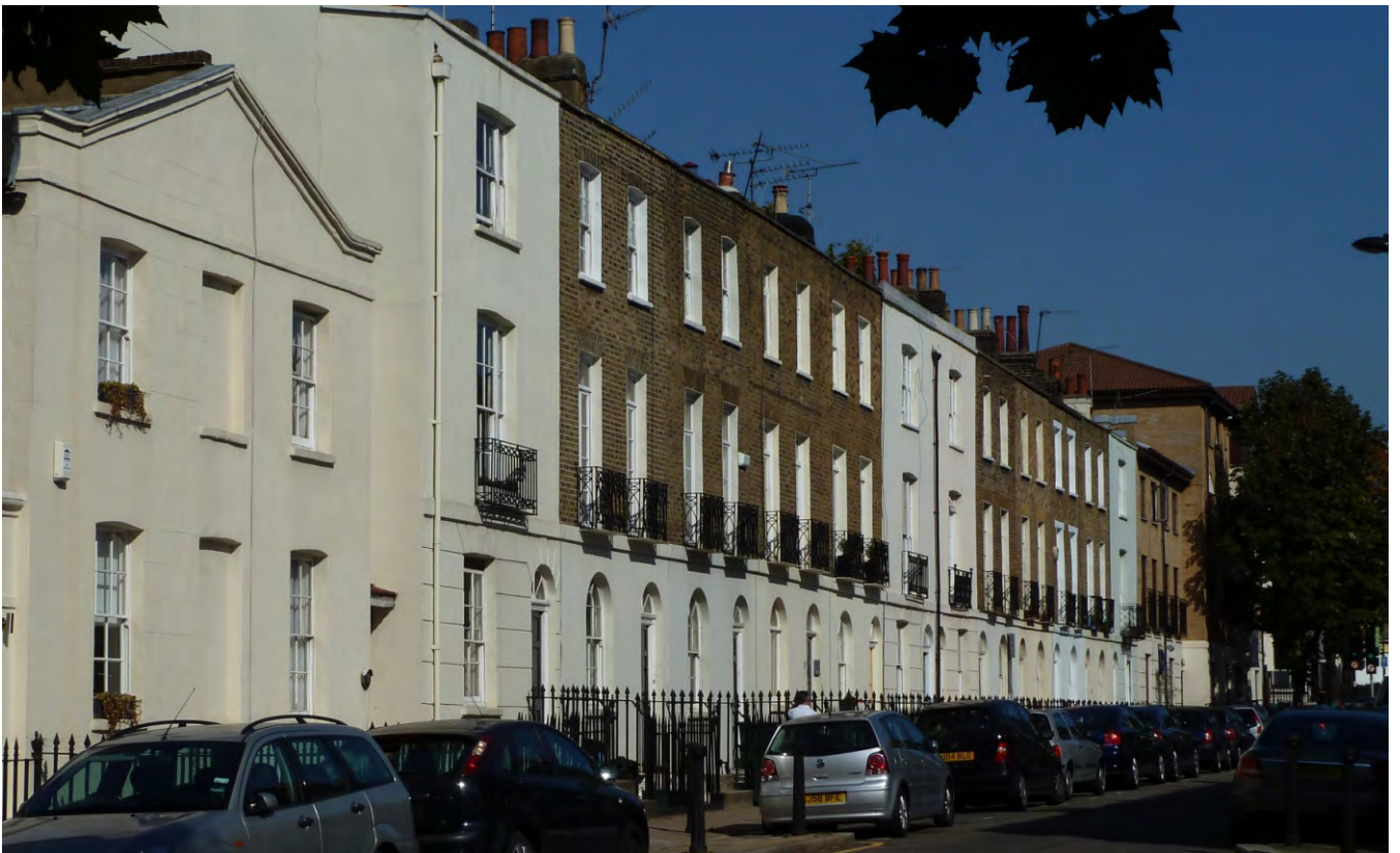
Appendix 2: 2.2 Oblique easterly view east along Jeffrey's Street, showing No. 13 in its context.