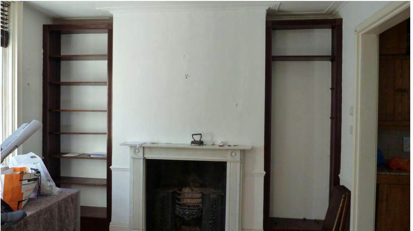
Appendix 2: 2.25 General view of the ground floor front room, showing the fireplace.