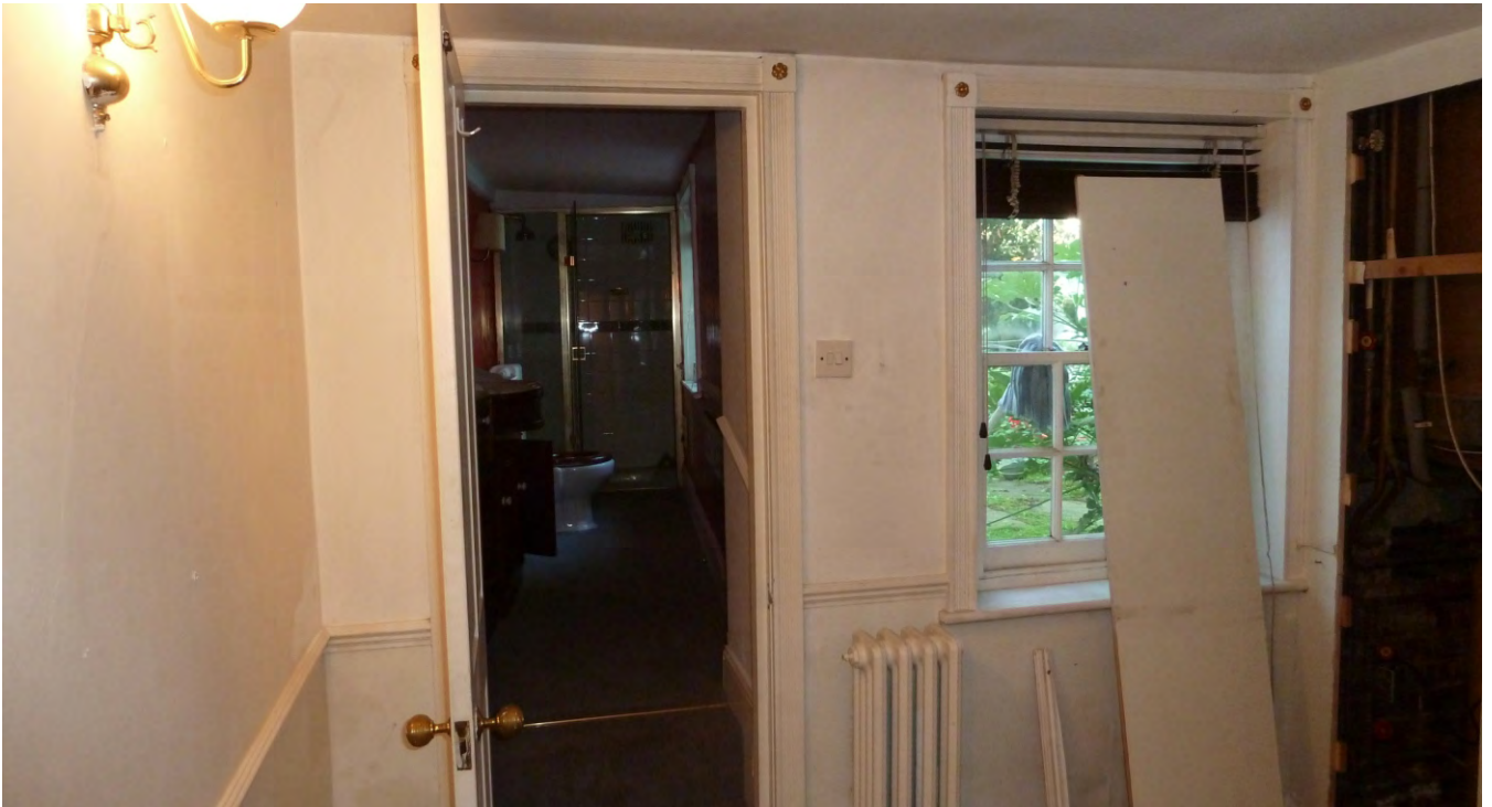
Appendix 2: 2.19 The rear basement room, looking towards the extension.