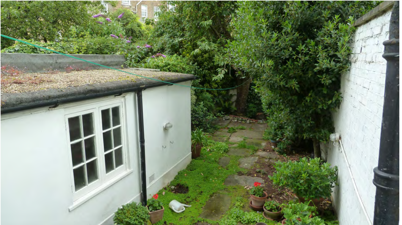
Appendix 2: 2.15 The rear extension from the back door.