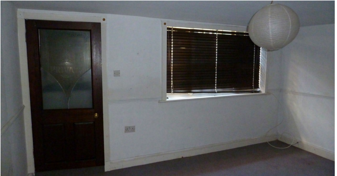
Appendix 2: 2.17 The front basement room.