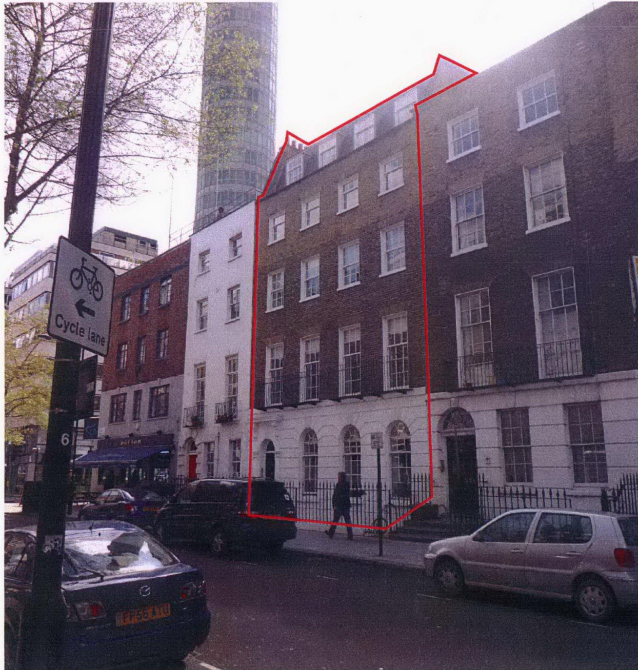
Elevation from Fitzroy Street