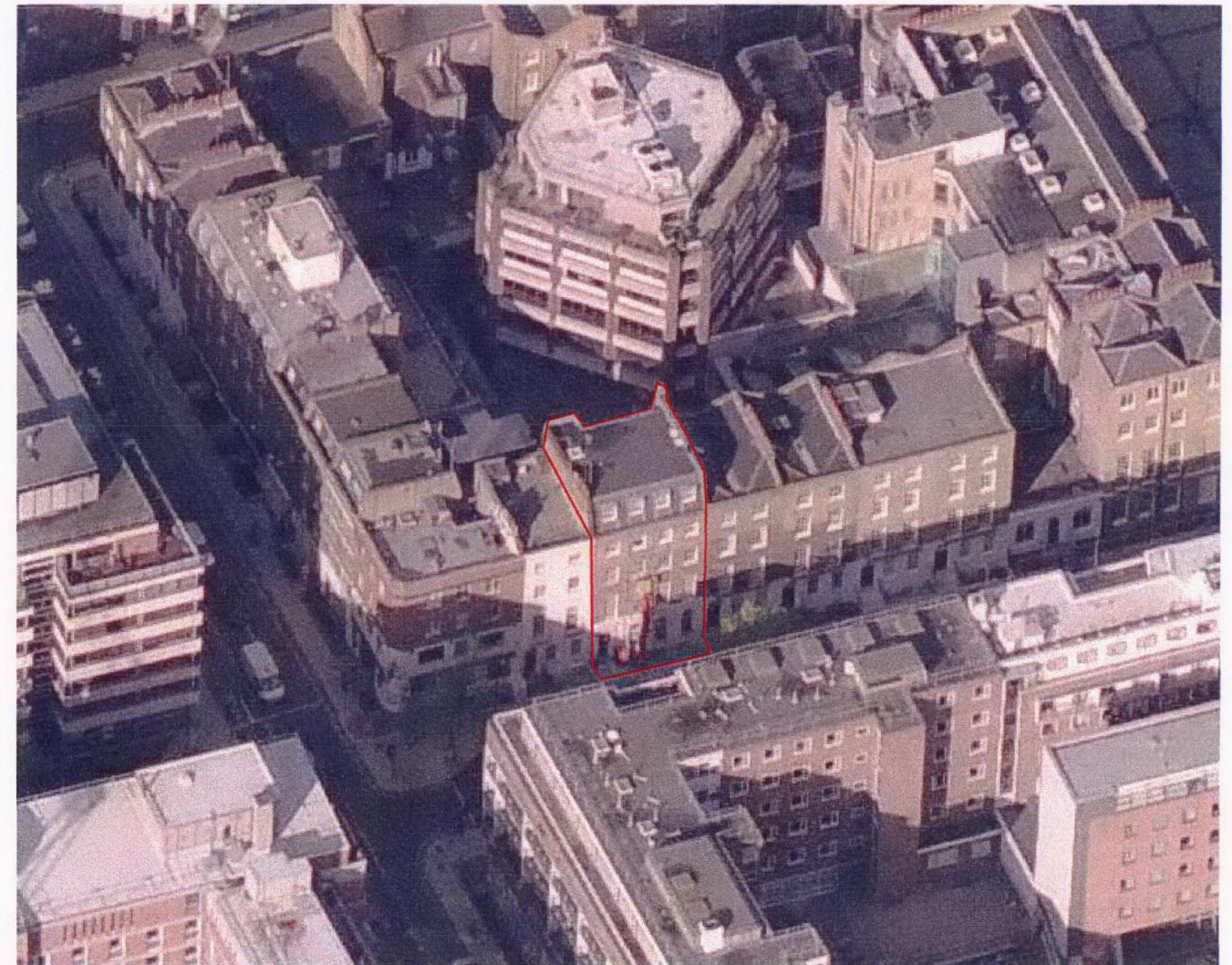
Aerial View looking East