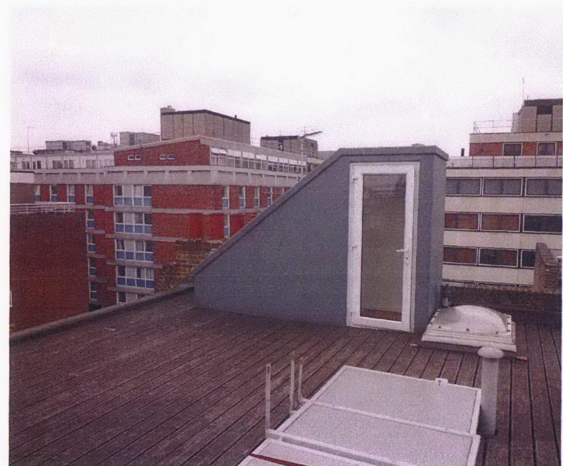
Existing Access to Roof