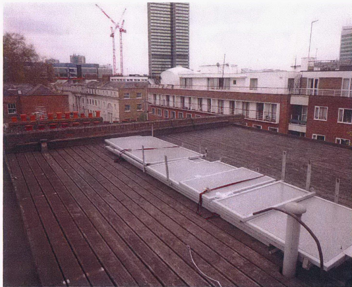
Existing View looking North down Fitzroy Street