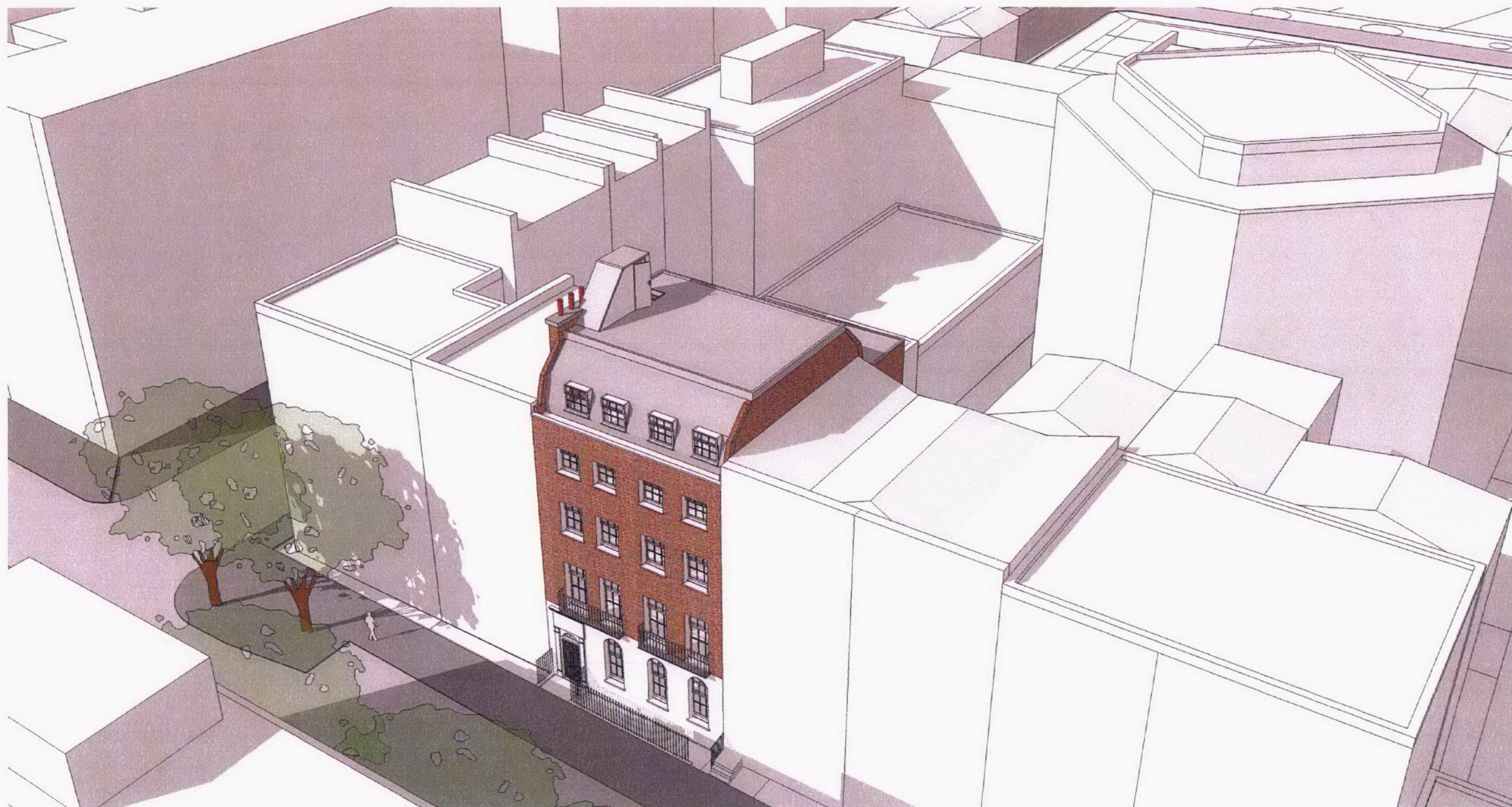
Existing Bird's Eye View