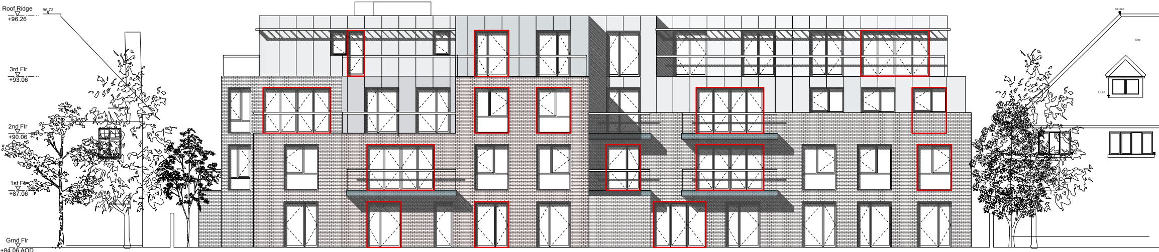
A East Elevation GE.01 1:200

Information contained within this drawing is the sole copyright of 21st Architecture Ltd. and is not to be reproduced without express permission. No implied licence exists. This drawing not to be used for land transfer or valuation purposes. Do not scale from this drawing. All dimensions & levels are to be checked on site by the contractor. Issued for purposes indicated only. Drawing errors and omissions to be reported to the architect.