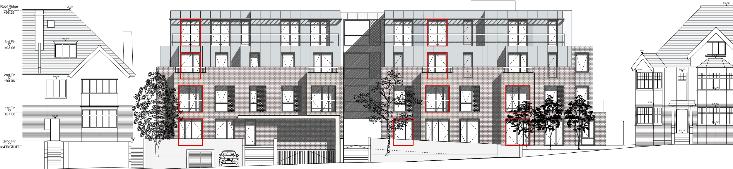
B West Elevation GE.01 1:200

All living rooms have at least 1 glazed floor to ceiling window panel without obstructions. All windows and doors are easily openable.