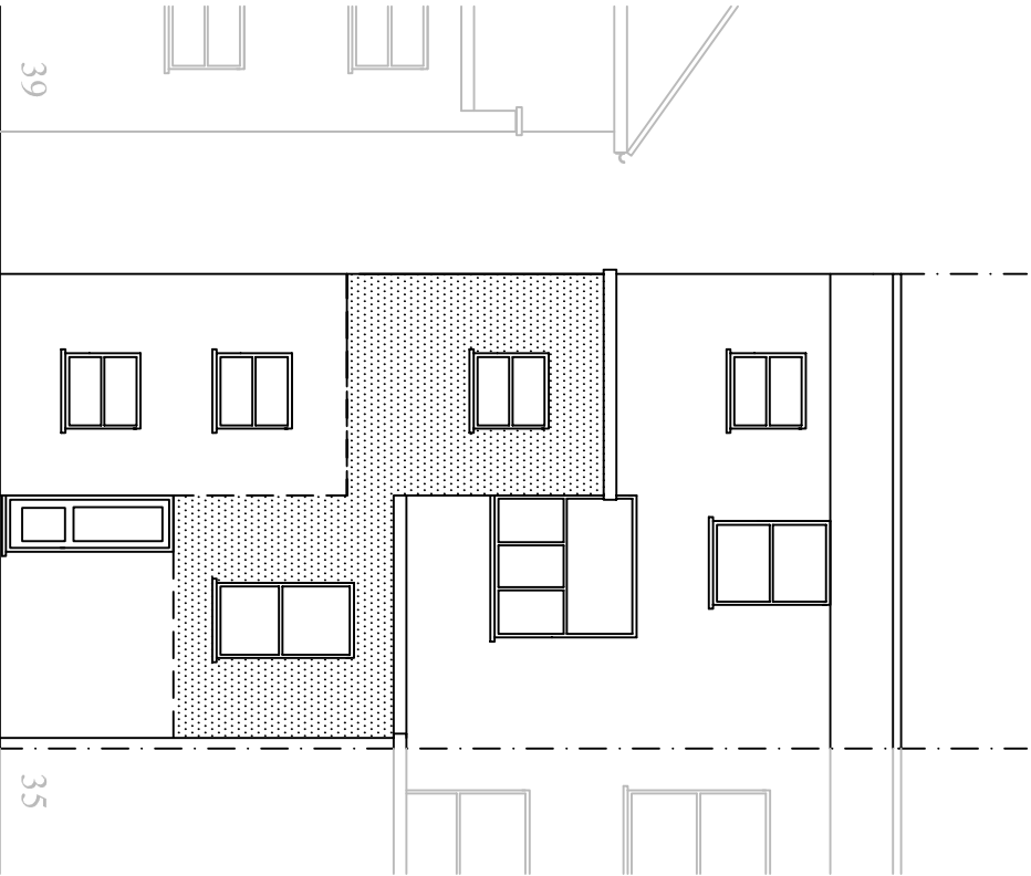
PROPOSED REAR ELEVATION (WEST)