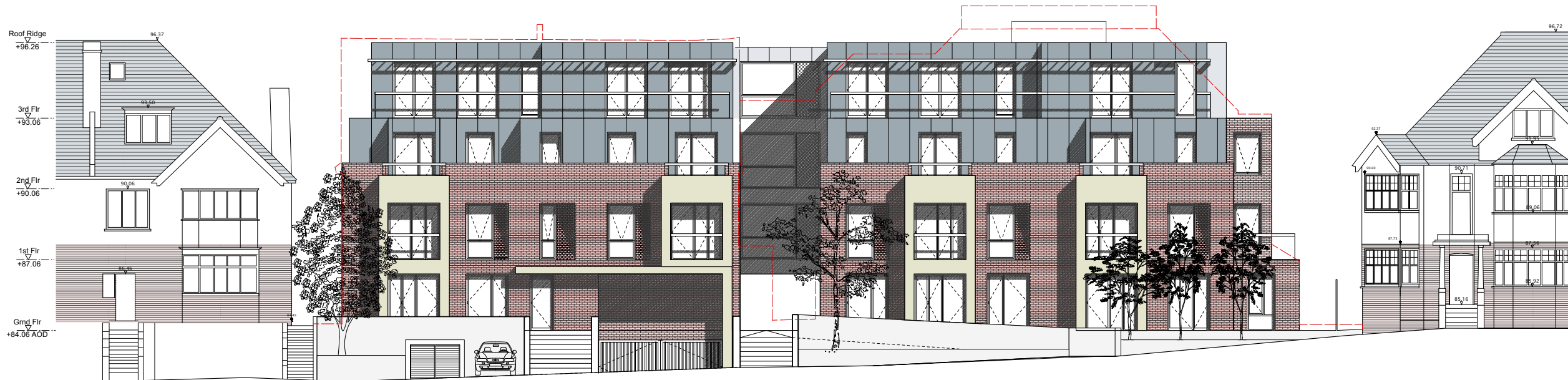
B GE.01 1:200 West Elevation