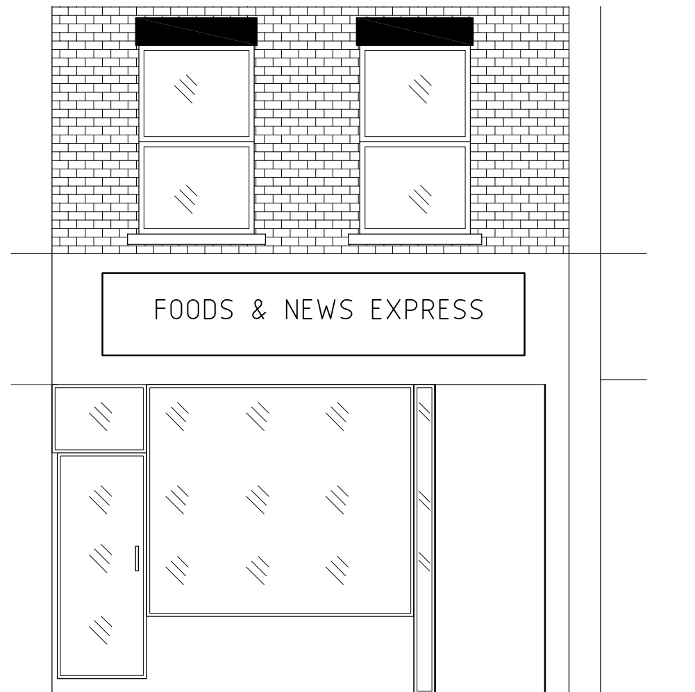
PROPOSED SHOPFRONT [SCALE 1:50]