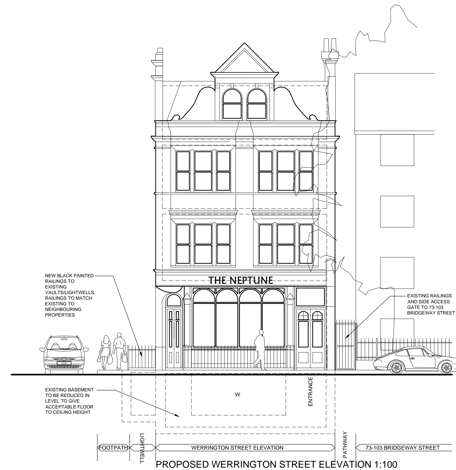
PROPOSED WERRINGTON STREET ELEVATION 1:100