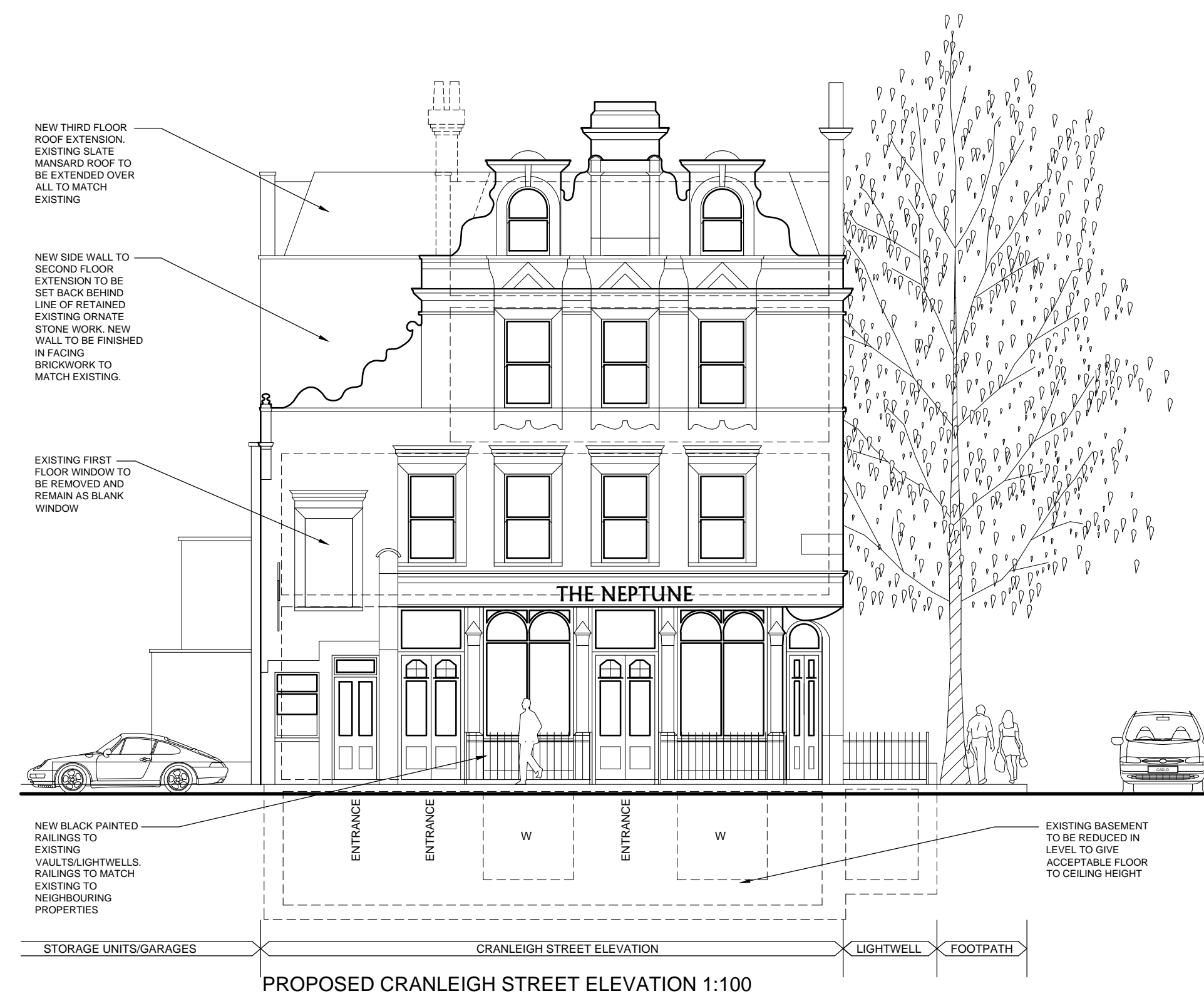
PROPOSED CRANLEIGH STREET ELEVATION 1:100

notes: Do not scale from this drawing All dimensions to be checked on site and any discrepancies reported to the Architect/Contract Administrator before proceeding with the works on site, or off-site fabrication Subject to site survey and inspection