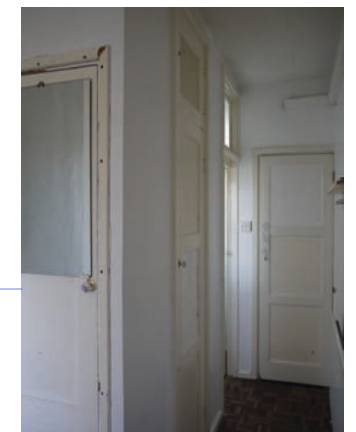
Partition 2 The view of wall between bathroom and hall proposed to be removed