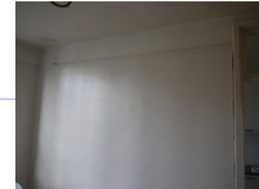
Partition 1 The view of wall between living room and kitchen proposed to be removed