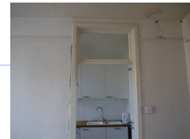
Partition 1 The view of wall between living room and kitchen proposed to be removed

250 mm step to conceal the drainage pipes from the sink and the soil pipe from Wc