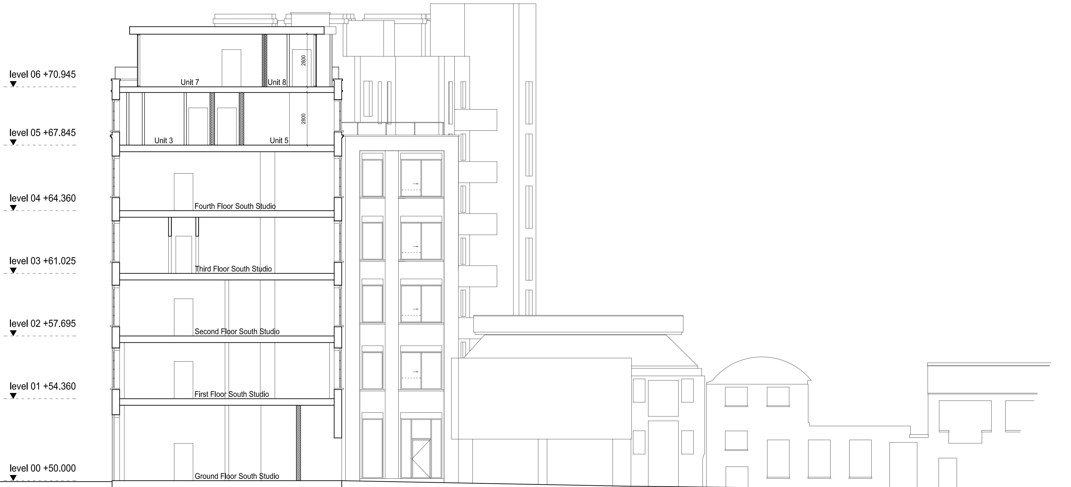
PROPOSED B-B' SECTION

ALL DIMENSIONS TO BE CHECKED ON SITE WORK TO FIGURED DIMENSIONS ONLY REPORT DISCREPANCIES TO THE ARCHITECT AT ONCE BEFORE PROCEEDING