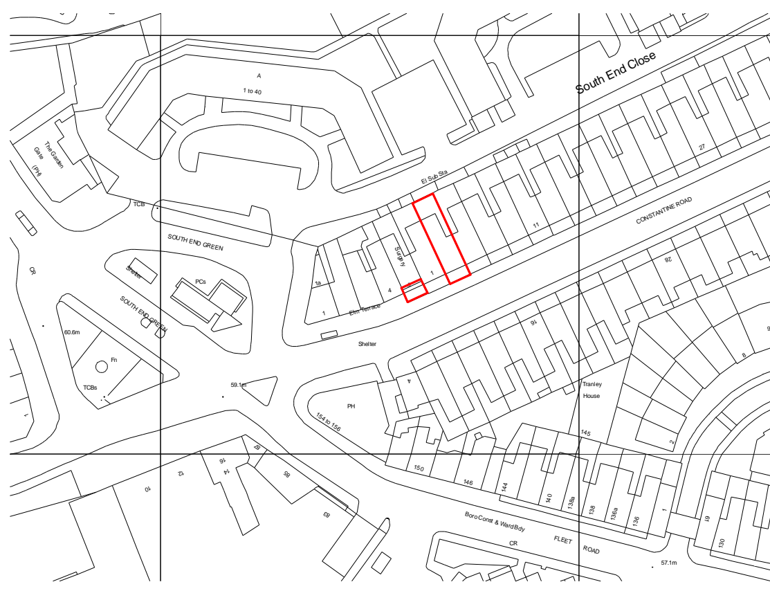
Location plan 1 : 1250