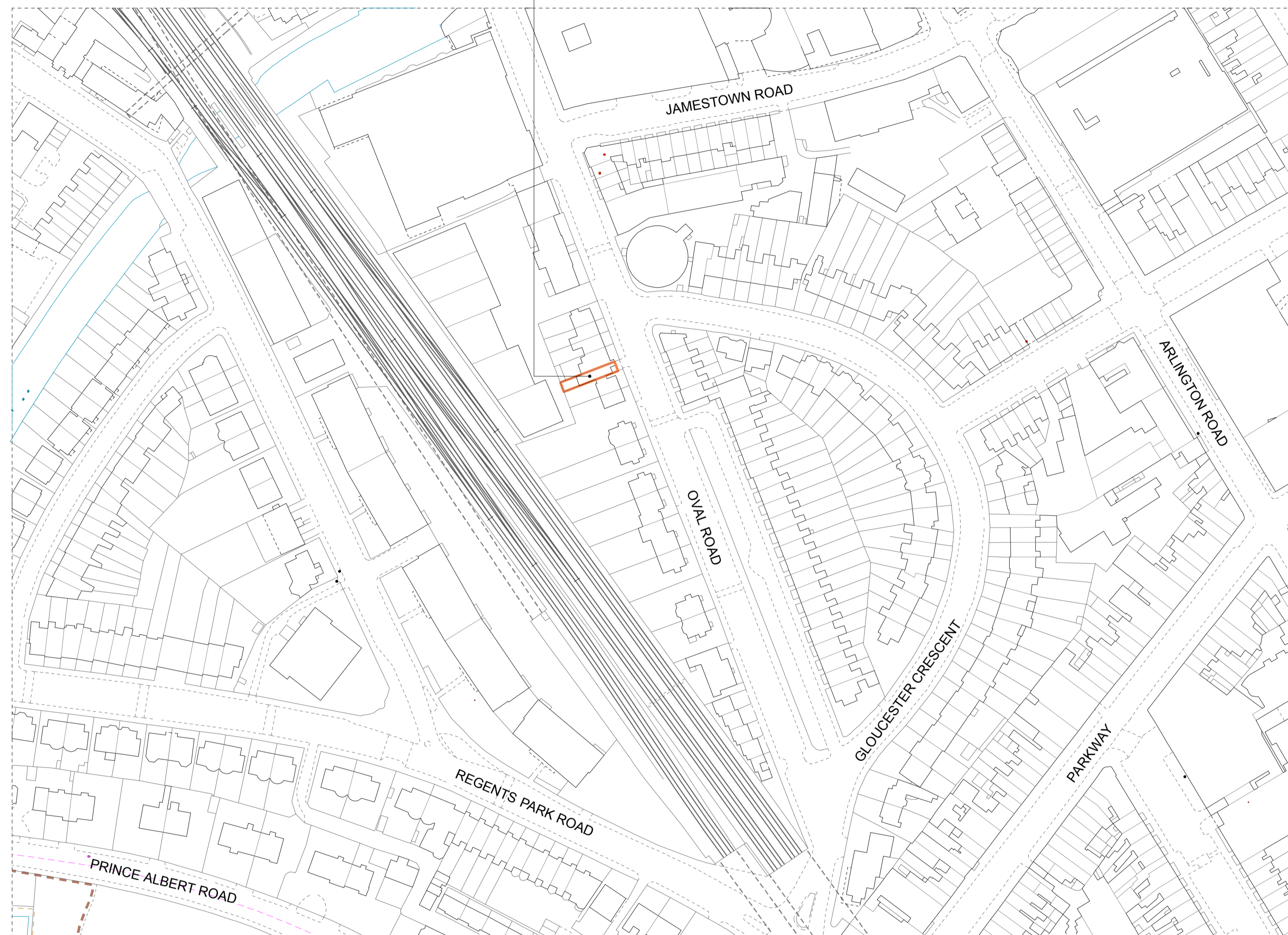
1 Location plan Scale: 1:1250