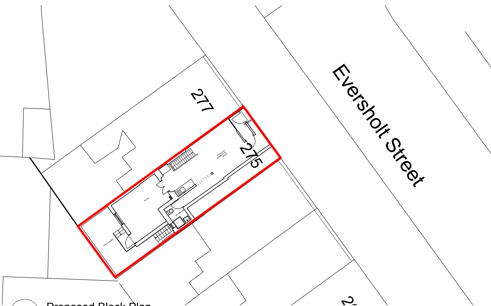
03 Proposed Block Plan 1:200

© COPYRIGHT The copyright in this drawing is vested in All Done Design Ltd. and no licence or assignment of any kind has been, or is, granted to any third party whether by provision of copies or originals of the drawings or otherwise unless otherwise agreed in writing.