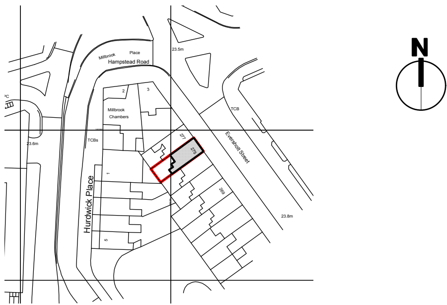
01 Location Plan 1:1250