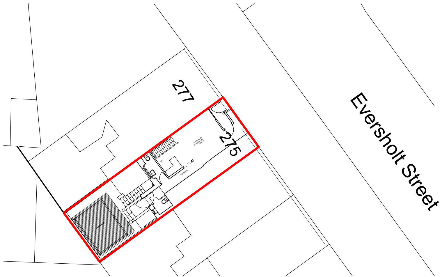
02 Existing Block Plan 1:200