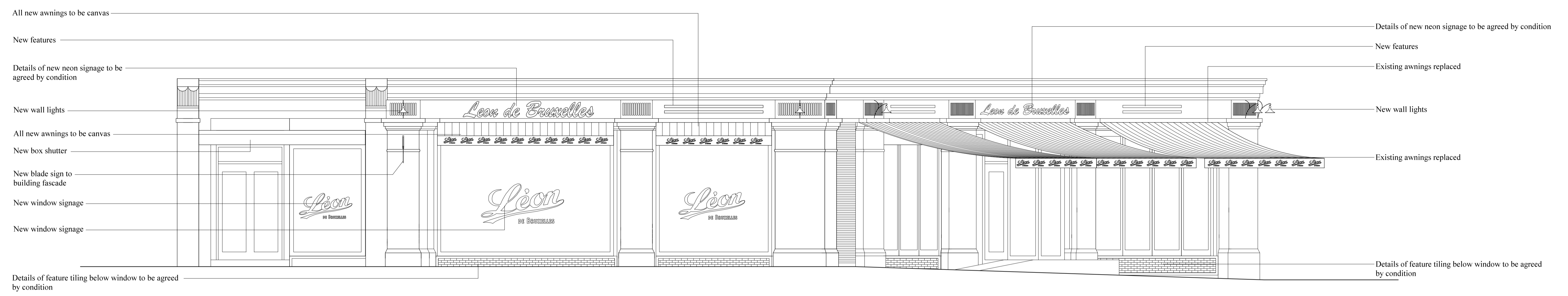
○ CHARING CROSS ROAD ELEVATION Scale 1:50 @ A1

NOTES: DO NOT SCALE: ALL DIMENSIONS TO BE CHECKED AND VERIFIED WITH ARCHITECT / INTERIOR DESIGNER PRIOR TO CONSTRUCTION