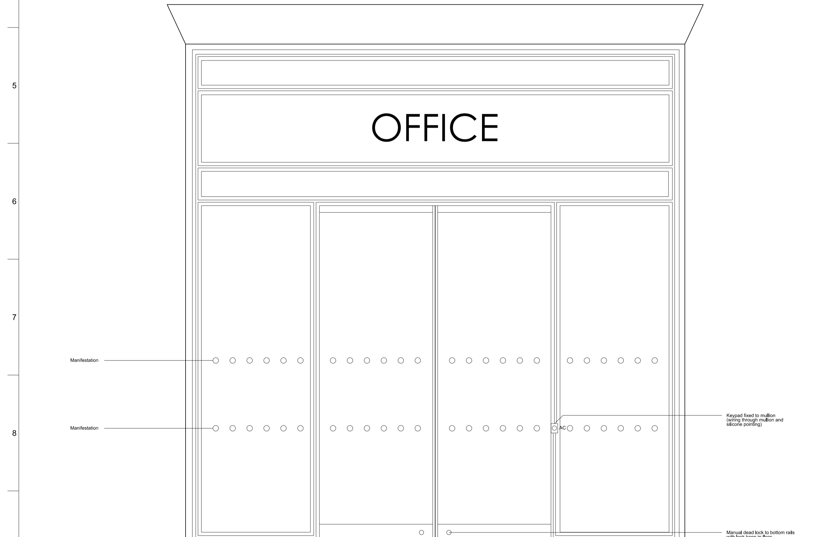
01 | G01/D1n - External Elevation