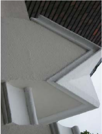
Existing pillar caps on pedestrian gateway to front elevation