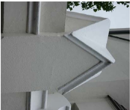
Existing pillar caps on pedestrian gateway to front elevation