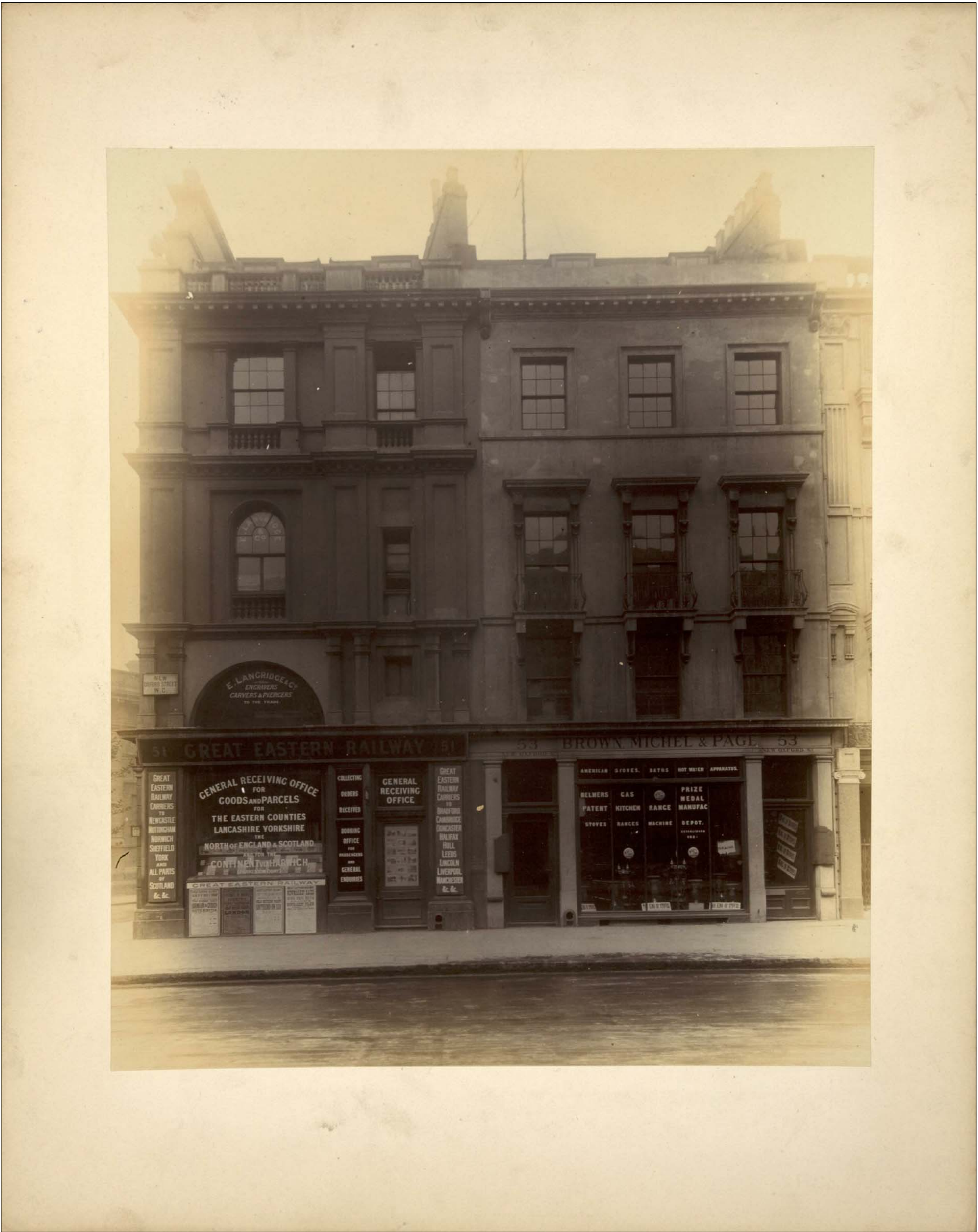
47 - 49 NEW OXFORD STREET, PHOTOGRAPH FROM 1896