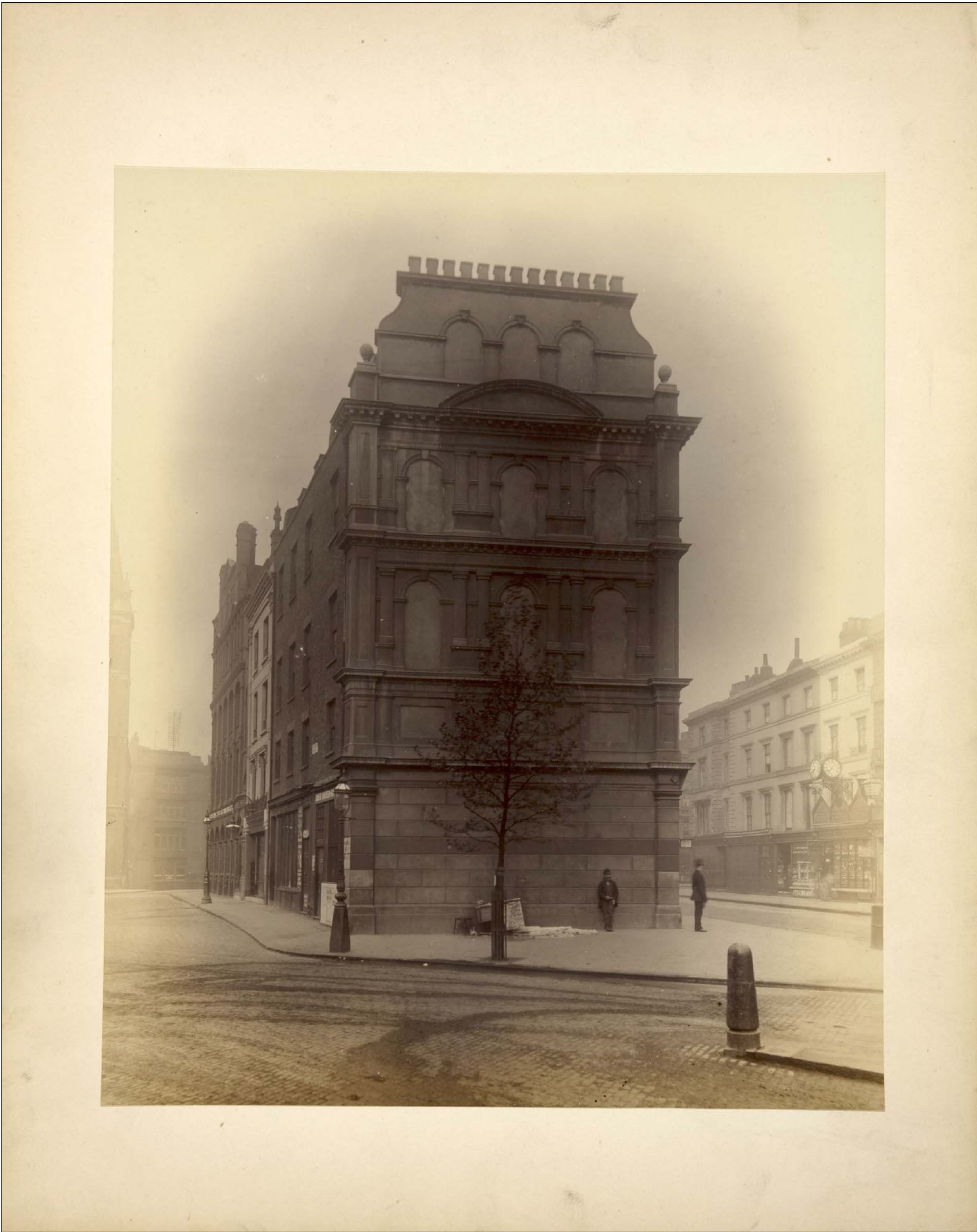
245 - 249 SHAFTESBURY AVENUE, END OF BLOCK. PHOTOGRAPH FROM 1896