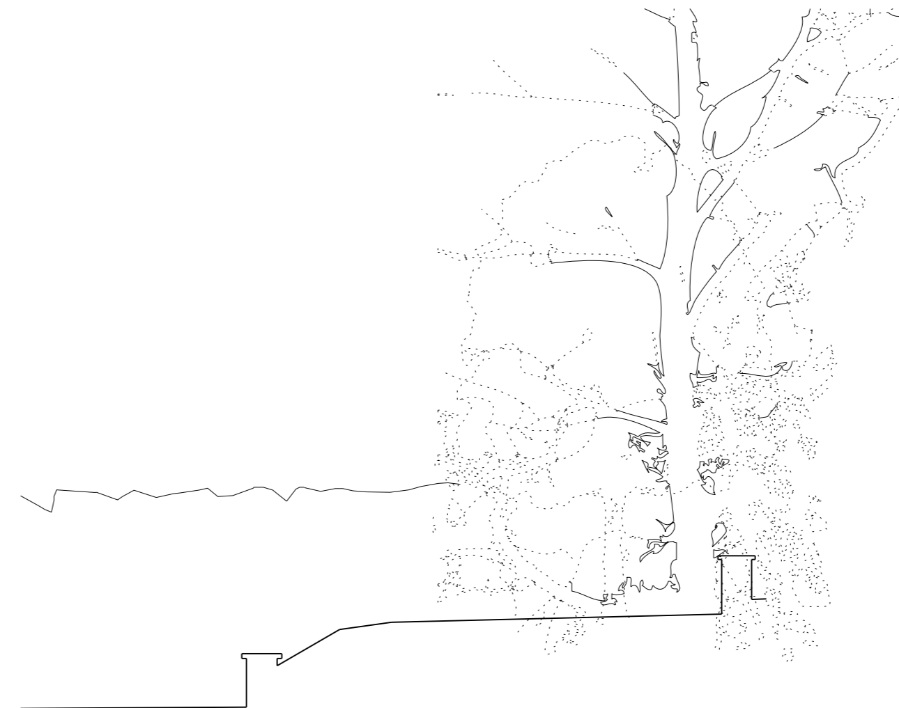
EXISTING SIDE ELEVATION TO GARDEN PATIO