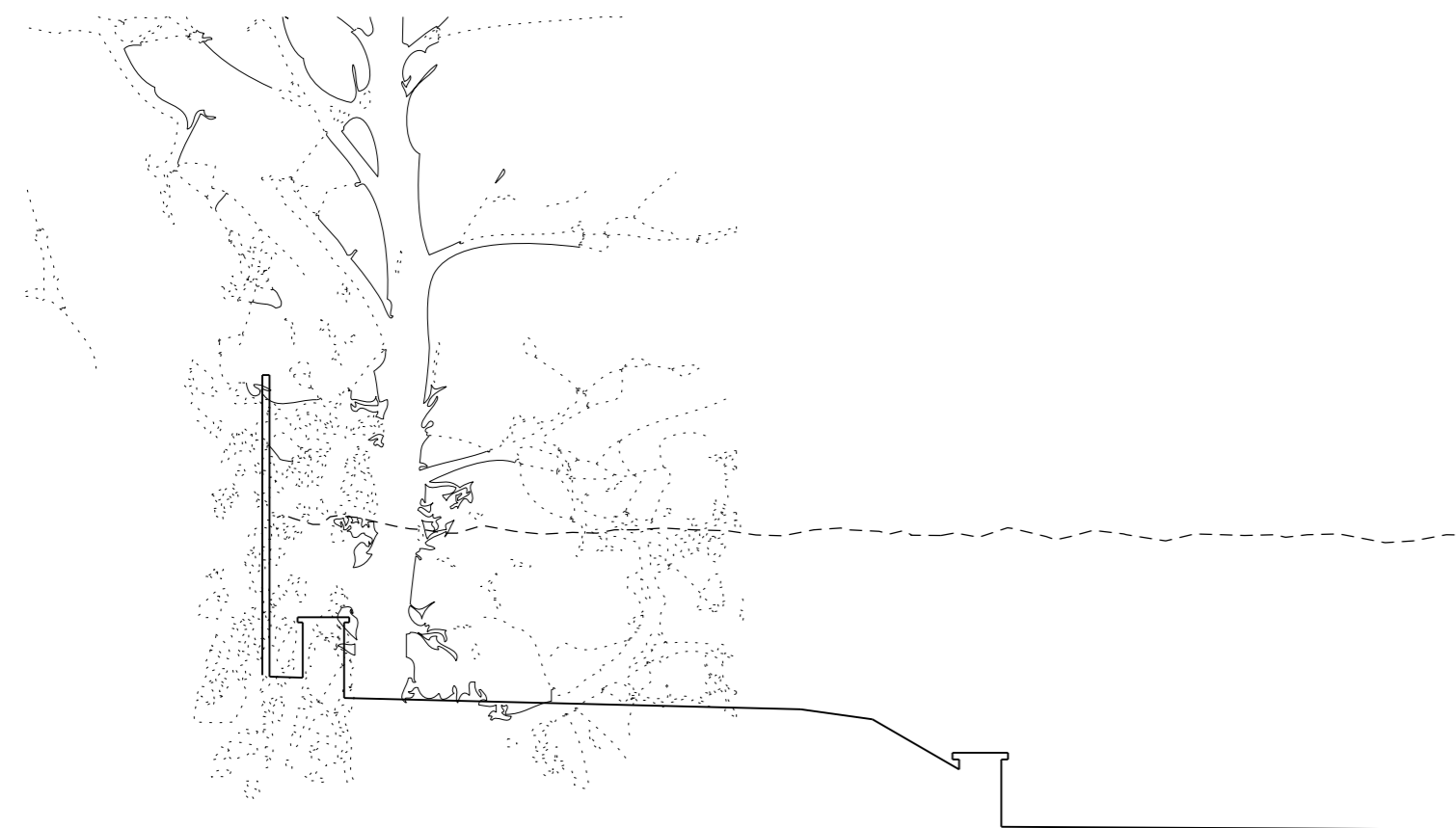
EXISTING SIDE ELEVATION TO NO. 20 MAIN HOUSE